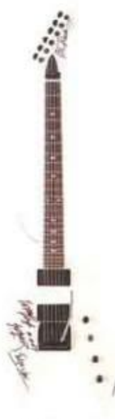
Warlock Custom B.N. (Kahler Tremolo)