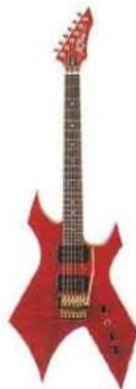
Warlock Custom B.N. (Special wood, binding, gold hardware)