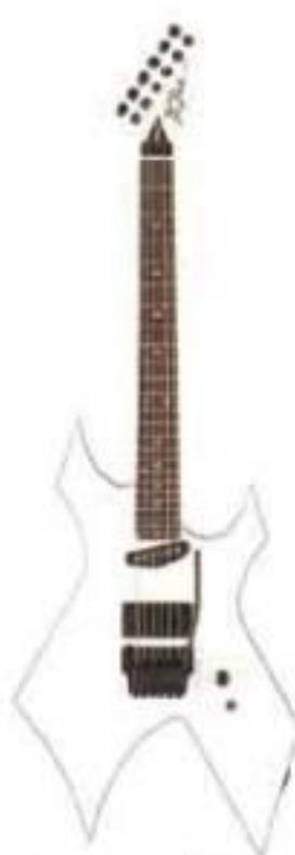
Warlock Custom B.N. (Body binding, 1 hum, 1 single)