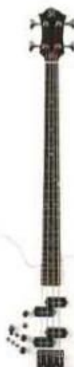
Mockingbird T.N. BASS (Lefty, 2 P Bass Combo, active electronics)