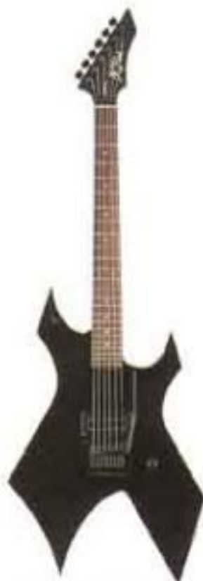
Warlock Custom B.N. (S. King)