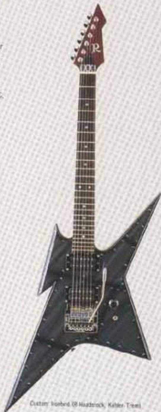
Custom Iceded 38 Headstock, Kahler Trem.