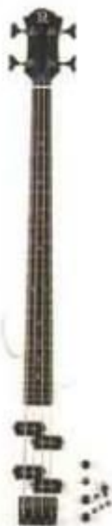
Eagle Custom T.N. BASS (2 P Bass Combo, Active Electronics)