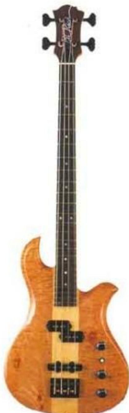
Eagle Custom T.N. BASS (traditional Style)