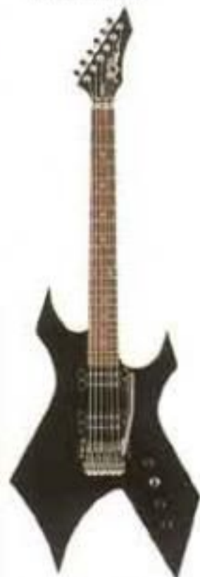
Warlock Custom B.N. (Binding, Chrome Hardware)