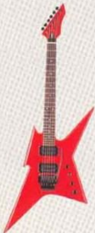
Custom Iceded T.N.