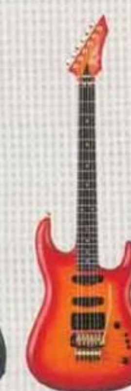
ST-III Custom T.N. (Special wood, gold hardware)