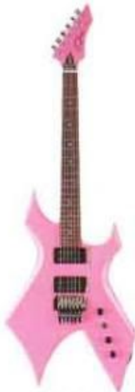
Warlock Standard T.N. (Chrome Hardware)