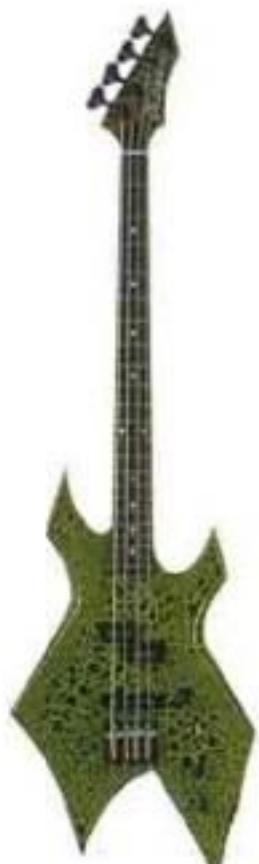
Warlock Custom T.N. BASS (Green crackle)