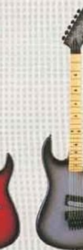
ST-III Custom B.N. (TM2 Model)