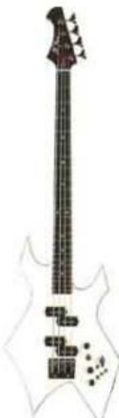
Warlock Custom T.N. BASS (Curved, inverted Headstock, active electronics)