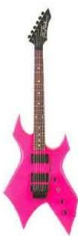
Warlock Standard B.N.