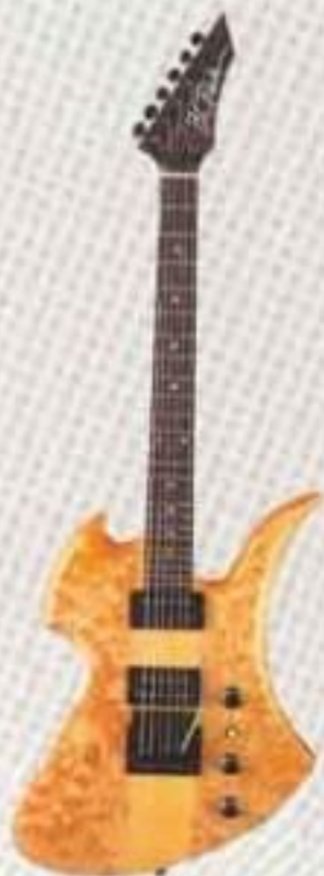
Mockingbird Custom T.N. (Special wood, Kahler tremolo)