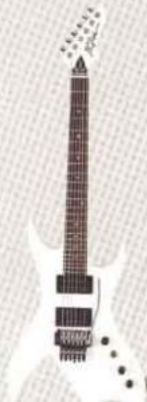
B.C. Custom T.N. (Small Body)