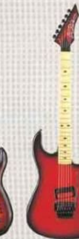
ST-III Custom B.N. (TM1 Model)