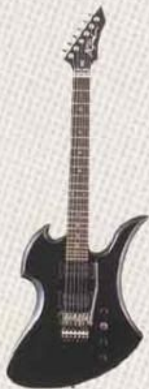
Mockingbird Custom B.R.