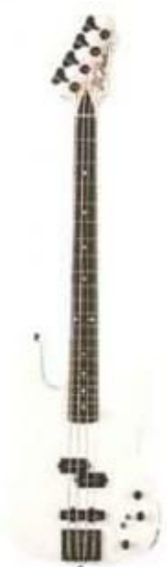
ST-III Standard B.M. BASS

Poison is in every major rock magazine sporting their B. C. guitars. Of course, bass player Bobby Dall and lead Guitarist C. C. DeVille play only B. C. Rich Guitars... That B.C. Rich is one of Poison's biggest fans.