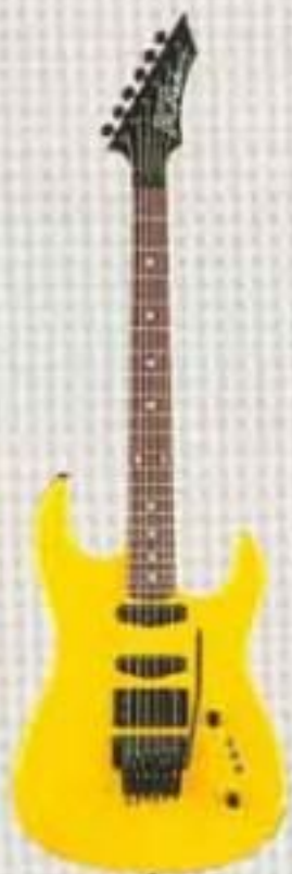
ST-III Standard T.N.