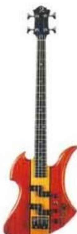
Mockingbird Custom T.N. BASS (Special wood, 2 P Bass pickups, Active Electronics)