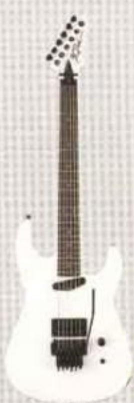
ST-III Custom B.N. (I Hum, I Single)