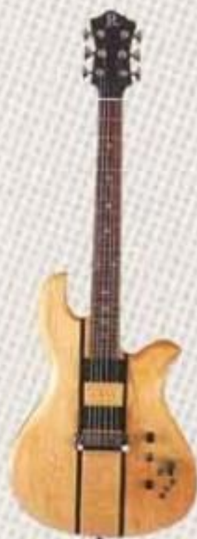
Eagle Custom T.N. (Traditional Style)