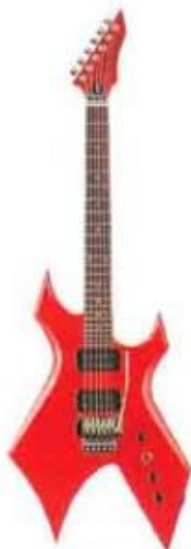
Warlock Standard T.N. (Chrome Hardware)