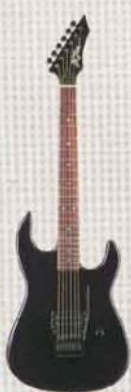
ST-III Custom B.N. (I Hum)