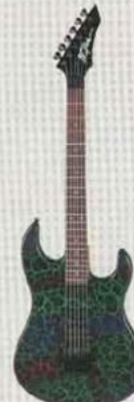
ST-III Standard B.N. (MacAlpine Crackle)