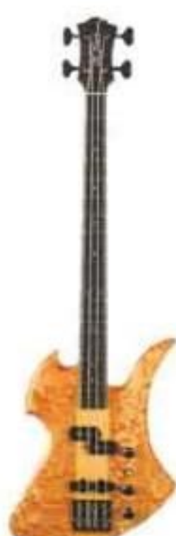
Mockingbird T.N. BASS (Special wood, P3 Combo, non-active)