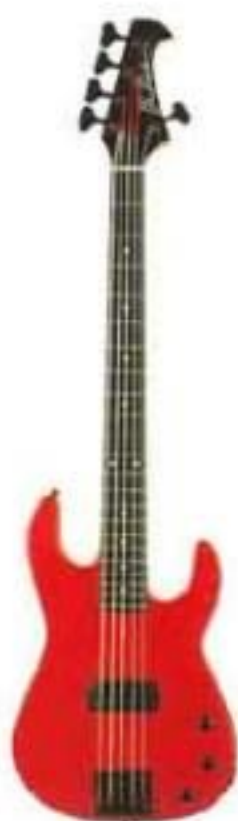
ST-V Torte Bass