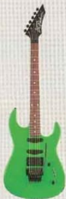
ST-II Standard B.N.

Tony MacAlpine knows that to be the best guitar player, he has no choice but to play the best guitar, both onstage, and in the studio. And of course, he knows who makes the best guitars in the world!