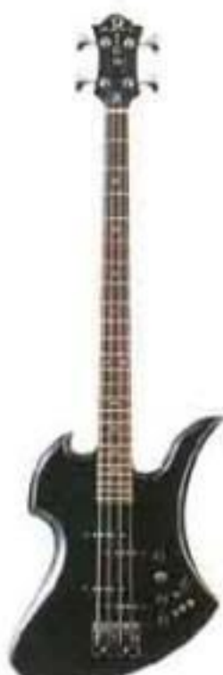
Mockingbird T.N. BASS (Traditional Style, Active Electronics)