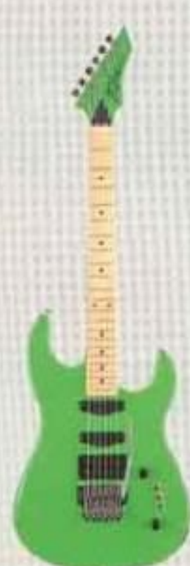
ST-III Custom B.N. (Maple Neck, Chrome)