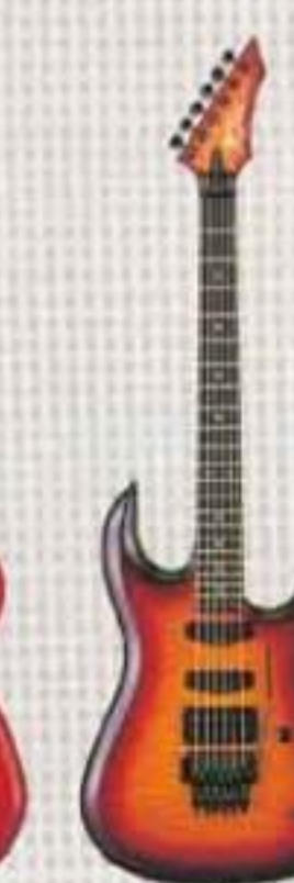
ST-III Custom T.N. (Special wood, black hardware)