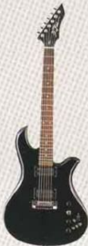
Eagle Custom T.N.