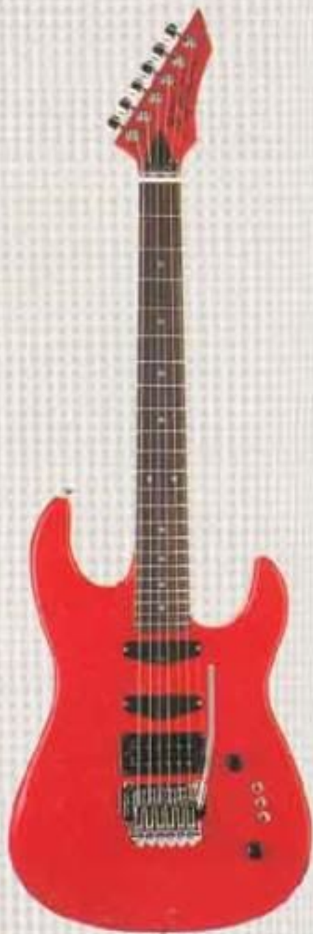
ST-III Standard B.N. (Chrome Hardware)