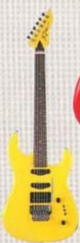
ST-III Standard T.N. (Chrome Hardware)