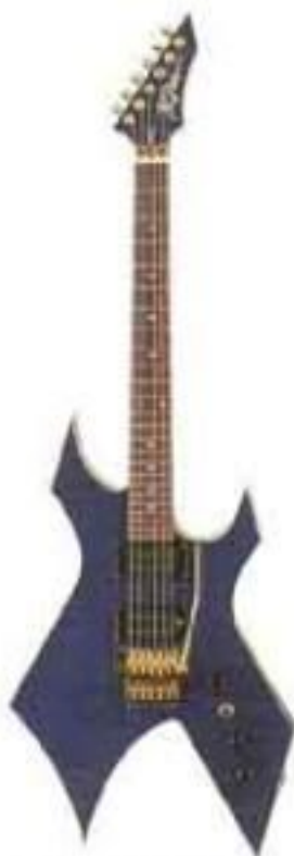
Warlock Custom T.N. (Special wood with body binding, gold hardware)