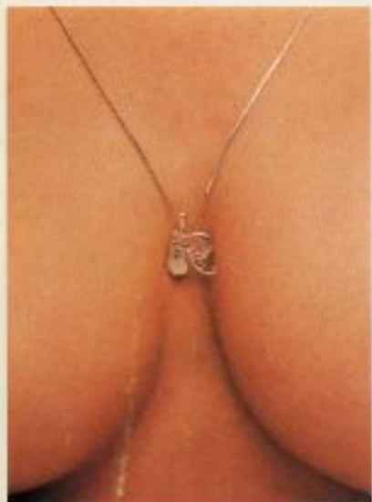
14K Gold "R" Logo Pendant