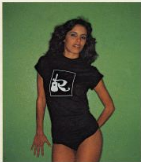
B.C. Rich T-Shirt