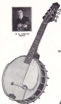
Mandolin-banjo Style MB-3

STYLE MB-3 (Master-tone Construction) This model is finished in accordance with the Master-tone construction style. It has rich mahogany rim and neck, selected for the upward tone of the wood. It has 14 frets, 12 scale, 12 fret, Gibson special finger-plate and carrying case. Same distinctive features as style MB-4.