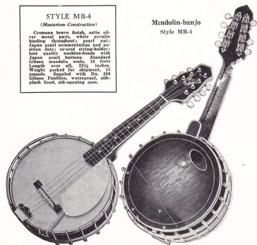
Mandolin-banjo Style MB-4

BALANCE OF TONE The special mandolin does not make an instrument which responds differently to its own register, or to the parts of the string, or to the position of other parts of the neck. The capable banjoist wants "top" as well as "bottom" in his tone. A construction of Gibson banjos enables us to give those exact requirements for all banjos.