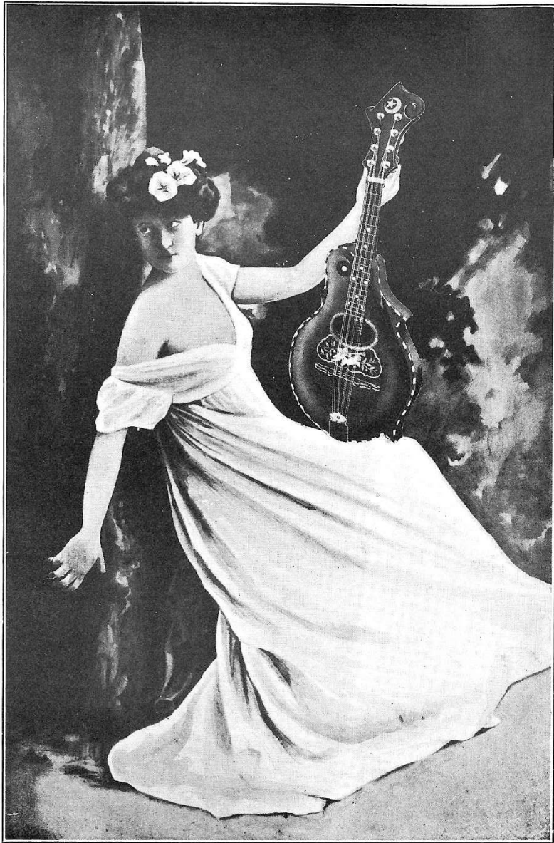
IT'S A GIBSON