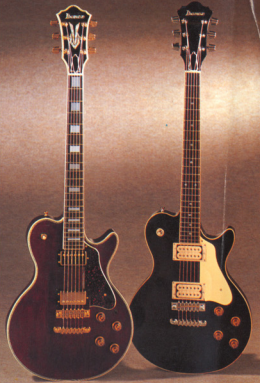
PF 350 CW