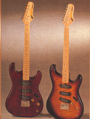
RS 300 TV