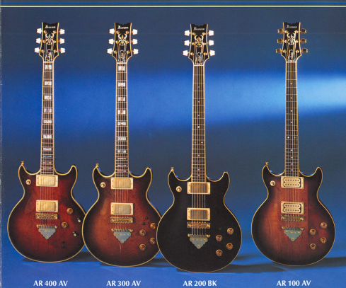
AR 400 AV AR 300 AV AR 200 BK AR 100 AV

3-Band EQ Tone System 2-Super 80 Tri-Sound Pickups Smooth neck heel 22 Velve Touch frets Controls: Master volume, master tone, boost, bass, midrange, treble, three position pickup selector, EQ in/out switch with LED indicator Colors: Antique Violin (AV), Black (BK)