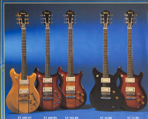
ST 300 NT ST 200 BS ST 105 BS ST 50 BK ST 55 BS