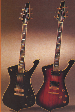
IC 100 BK