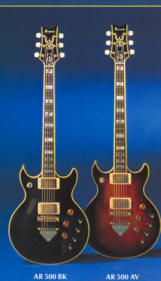
AR 500 BK AR 500 AV