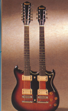
ST 1200 BS