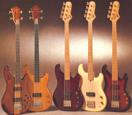
MC 900 DS