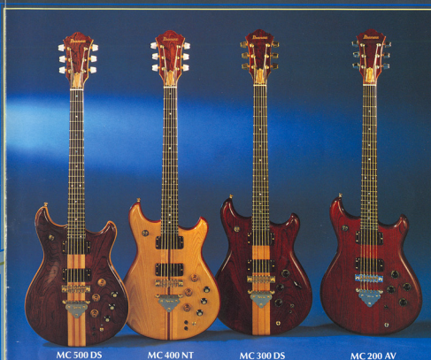
MC 500 DS MC 400 NT MC 300 DS MC 200 AV

5-piece laminated maple and walnut neck runs full length of instrument 2-Super 80 Pickups fingerboard pickup with Tri-Sound 24 Velve Touch frets Controls: Individual volume & tone, three position pickup selector Colors: Dark Brown Stained (DS), Natural (NT)