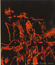
Sly and the Family Stone