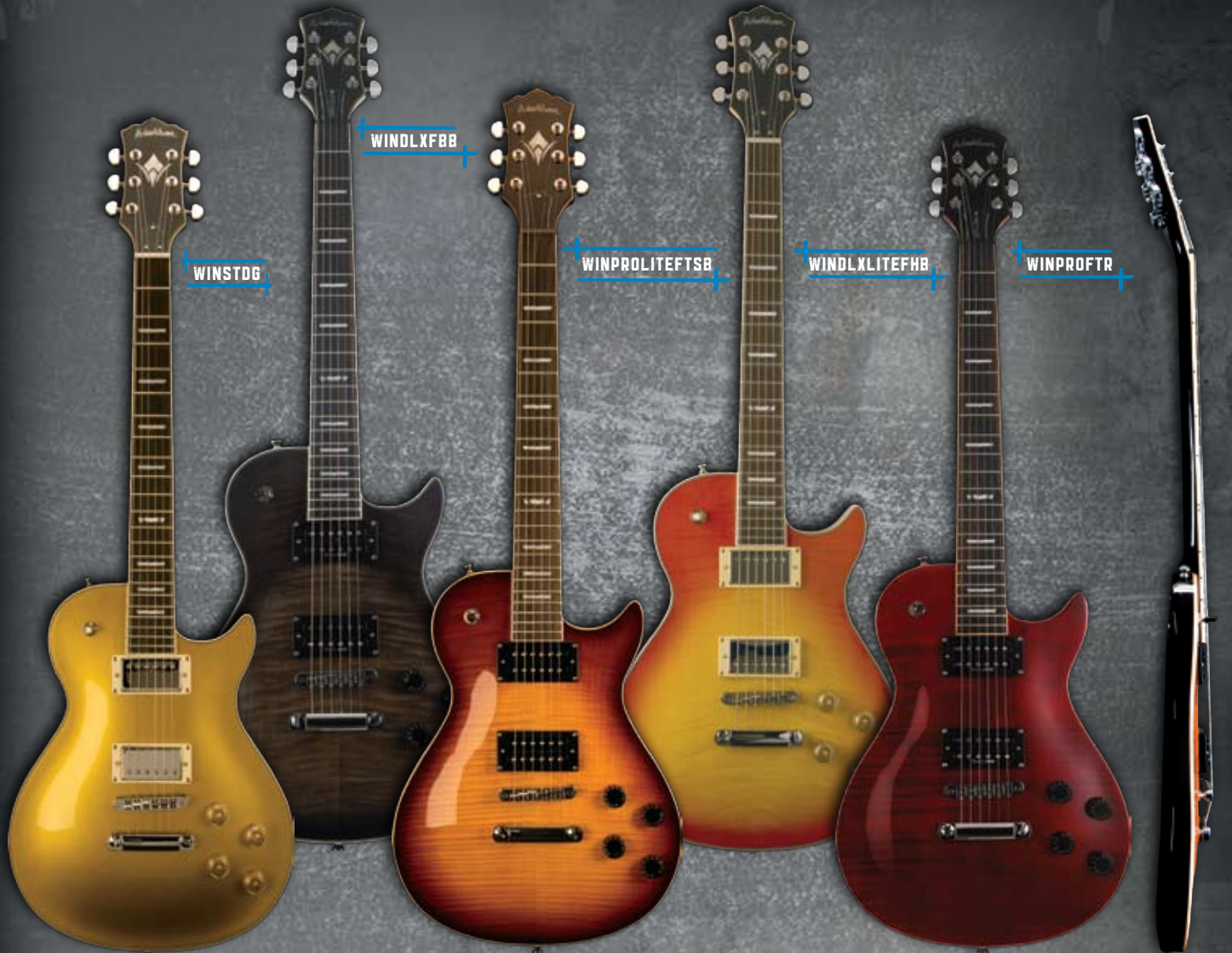
SIDE VIEW OF THE WINPROLITE