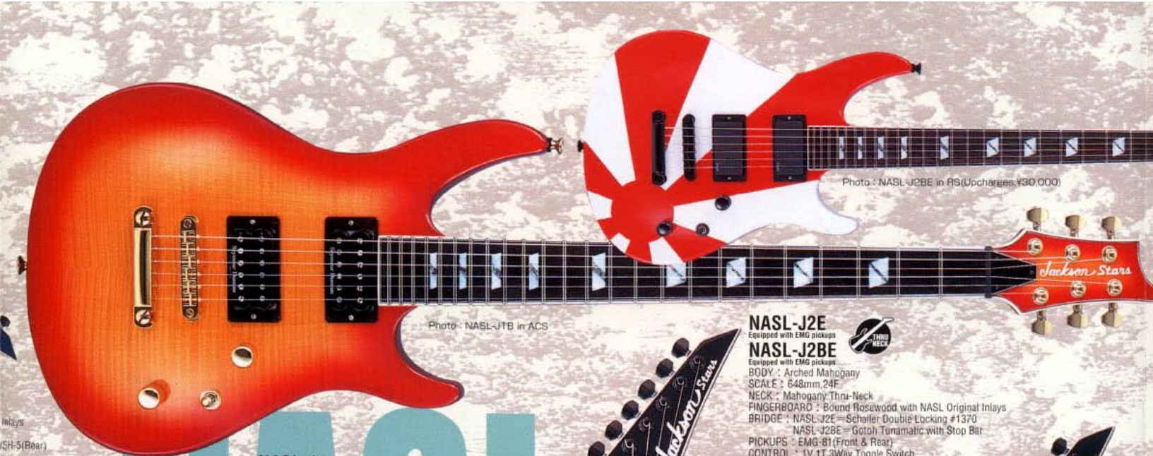
Photo: NASL-J1B in ACS

Equipped with Seymour Duncan pickups SL-J2BE Equipped with EMG pickups BODY: Alder SCALE: 648mm, 24F NECK: Maple Thru-Neck FINGERBOARD: Bound Striped Ebony with Sharkfin Inlays BRIDGE: Gotoh Tunamatic, Strings-Thru Body PICKUPS: SL-J2B = Seymour Duncan SH-1n(Front)/SH-5(Rear) SL-J2BE = EMG-81(Front & Rear) CONTROL: 1V, 1T, 3Way Toggle Switch HARDWARE: Black FINISHES: BK, DMB, DMR, PT, SBK & Optional Finishes (Graphics) PRICE: SL-J2B = ¥125,000 (w/Original Soft Case) SL-J2BE = ¥140,000 (w/Original Soft Case)