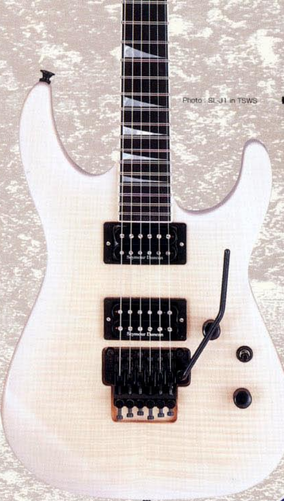
Photo: SL-J1 in TSWS