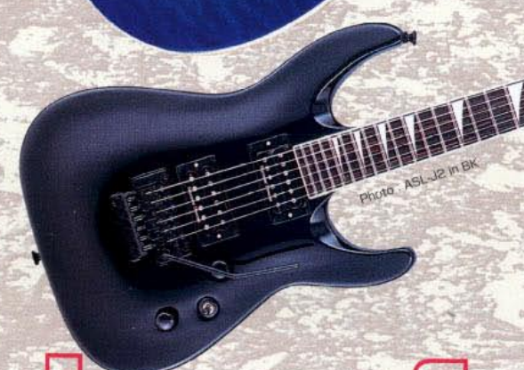
Photo: ASL-J2 in BK