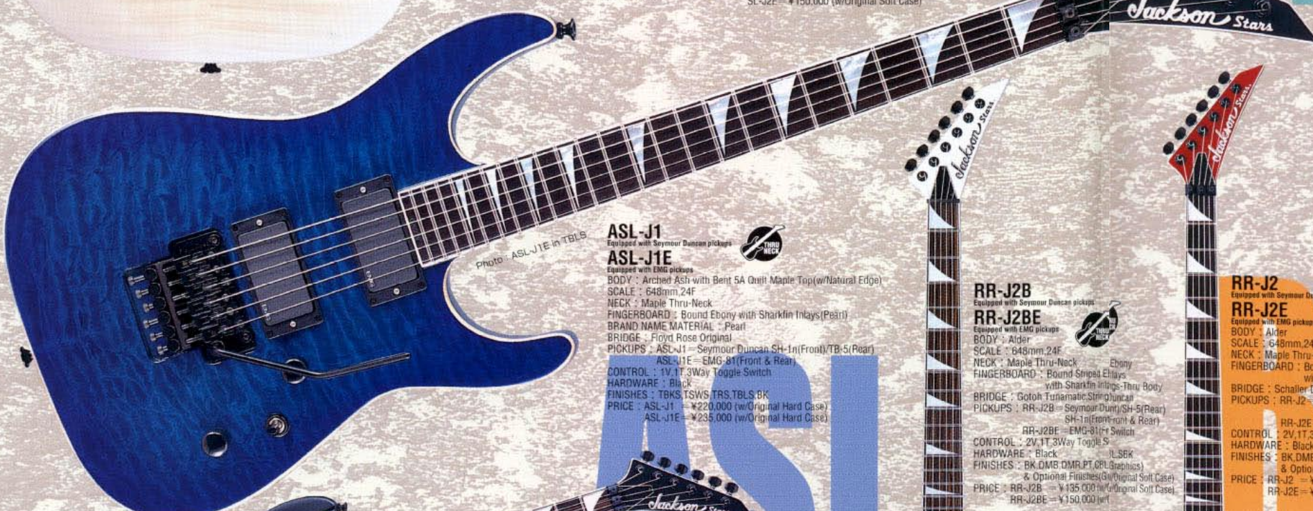
Photo: ASL-J1E in TBLs