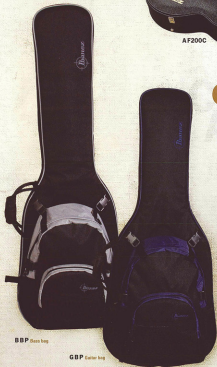
BBP Bass bag

Now you can have it all. Well, at least you can carry it all in style. The ingenious new Ibanez GBP and BBP combination bags feature a separable backpack and heavy-padded gig bag.