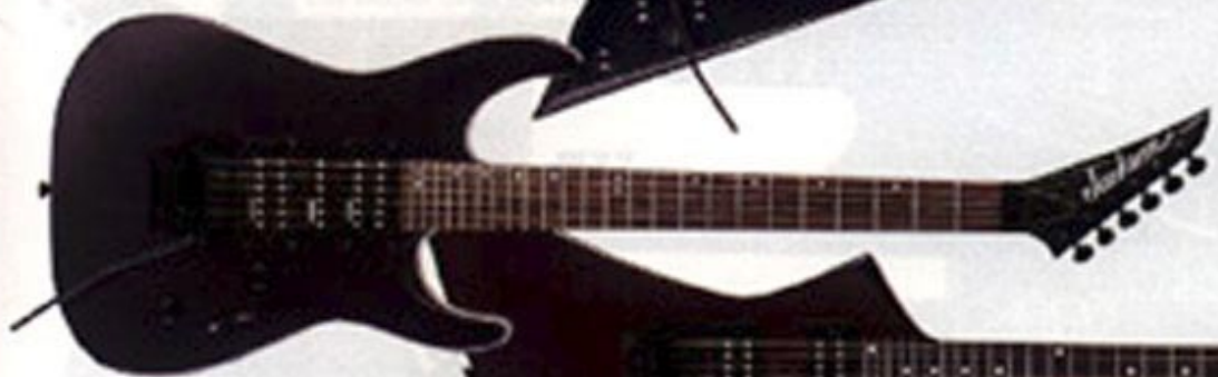
PS4 Black Cherry