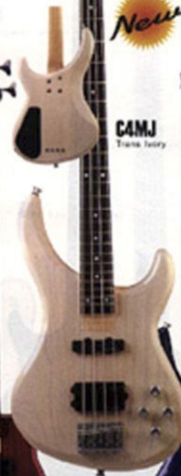
C4MJ Trans Ivory