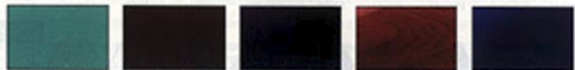
SFG Sea Foam Green DMR Dark Metallic Red DMV Deep Metallic Violet DTR Deep Trans Red CMB Metallic Blue