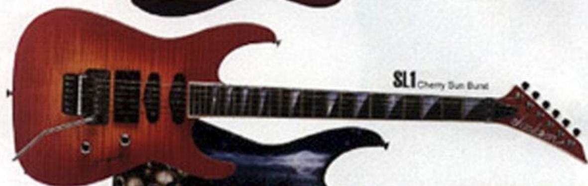
SL1 Cherry Sun Burst