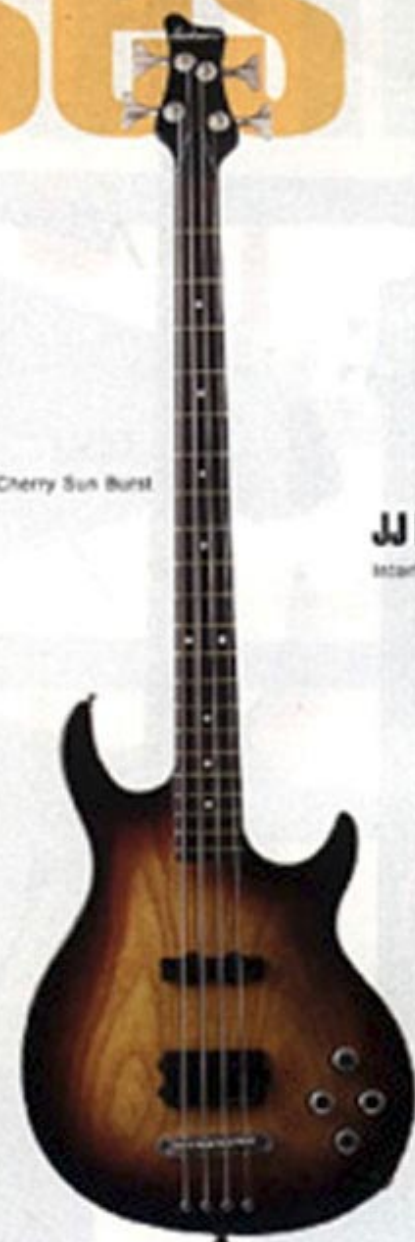
LS Burnt Cherry Sun Burst