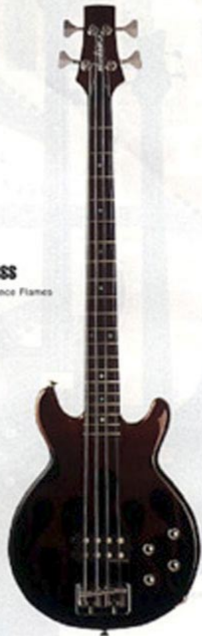
JJ Bass Starfire Flames

For specs and finish options see pages 18, 19, & 20