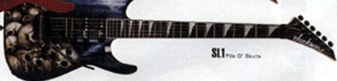
SL1 Pile of Skulls