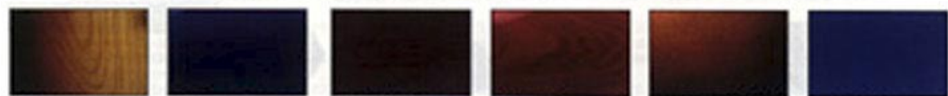
BCSS Burnt Cherry Surlburst DCB Deep Candy Blue TP Trans Purple TR Trans Red TBS Tobacco Surlburst CBL Cobalt Blue