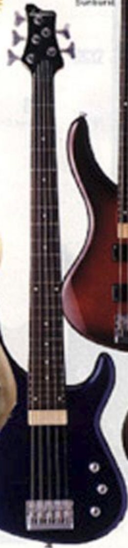
C5P Dark Candy Blue