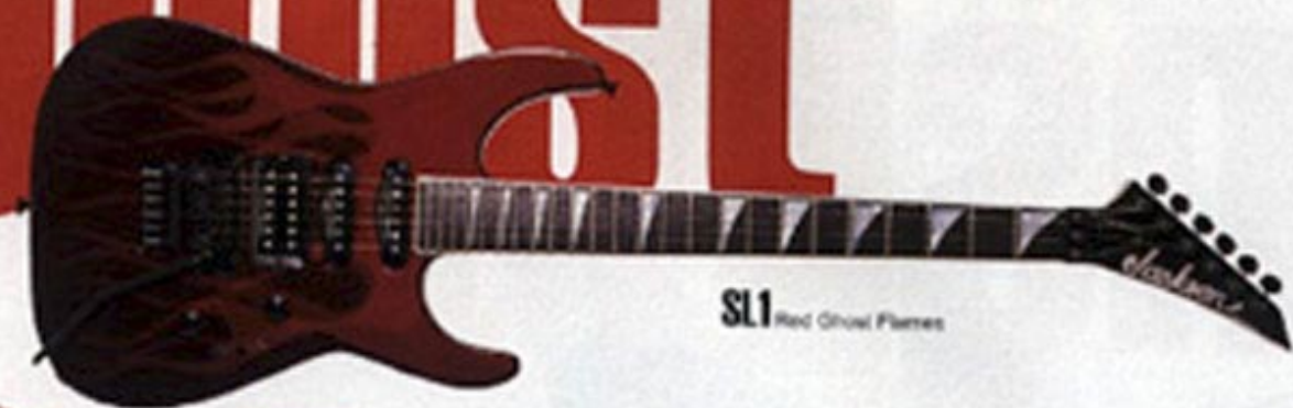
SL1 Red Ghoul Flames