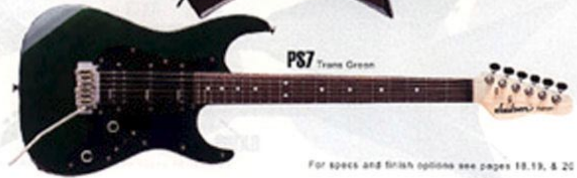
PS7 Trans Green