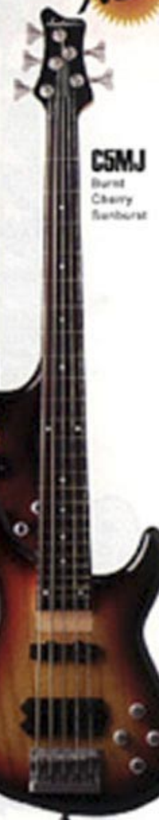
C5MJ Burst Cherry Sunburst