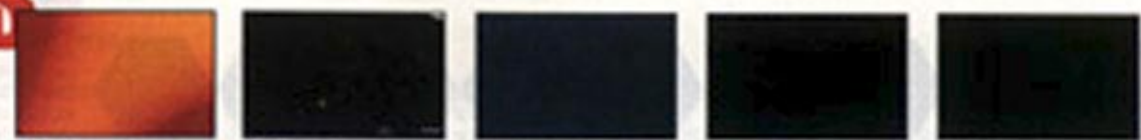
CSB Cherry Surlburst BC Black Cherry BCP Blue Green Pearl BLK Black MBK Metallic Black