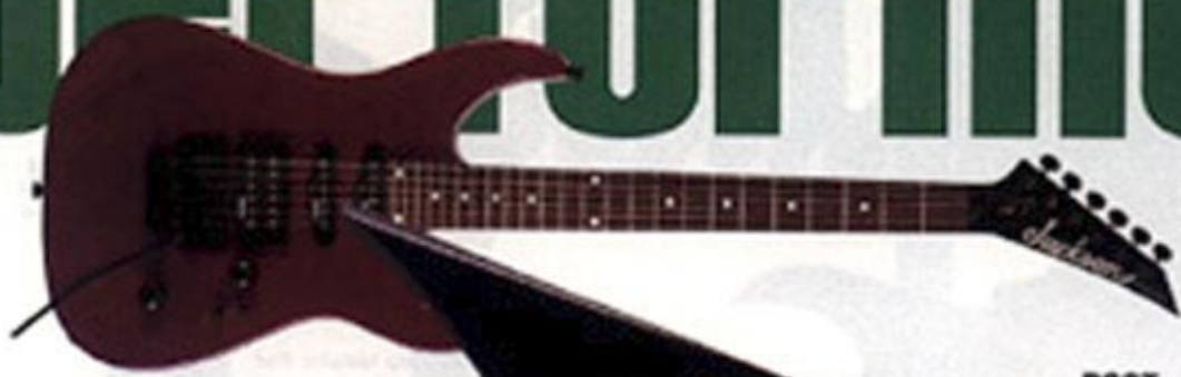
PS2 Red Violet Metallic