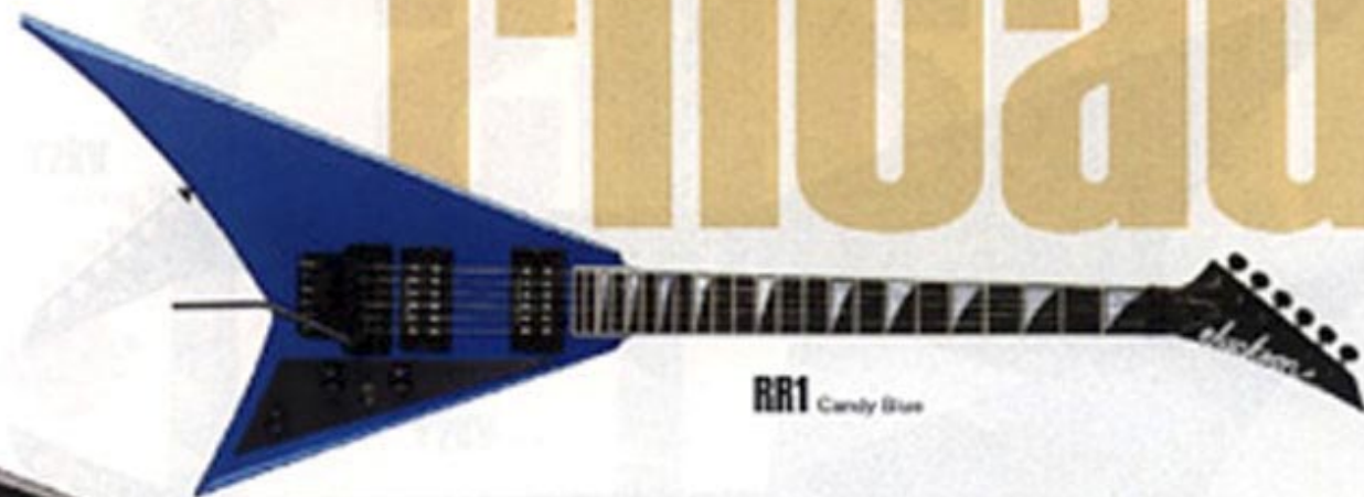
RR1 Candy Blue