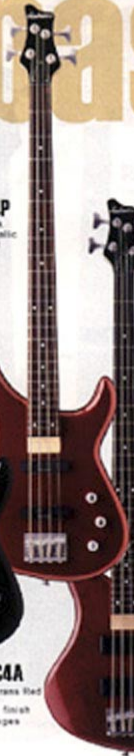
C4P Dark Metallic Red