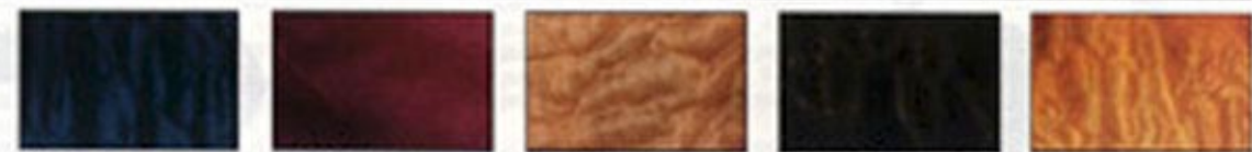
CHL Chikine EUP Euphoria NAT Au Natural MOC Mocha SOL Solar