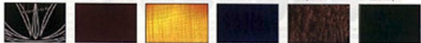
Tattoo RVM Red Violet Metallic TA Trans Amber TB Trans Blue TBK Trans Black TG Trans Green