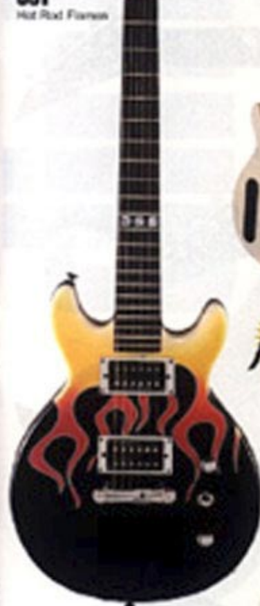
JJ1 Hot Rod Flame

For specs and finish options see pages 18, 19, & 20