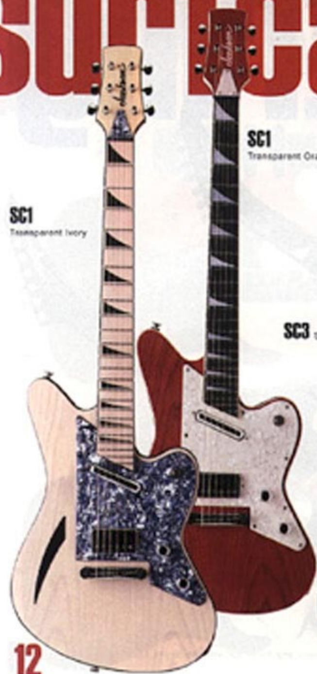
SC1 Transparent Ivory