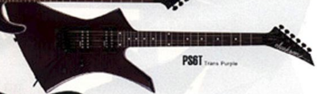
PS6T Trans Purple