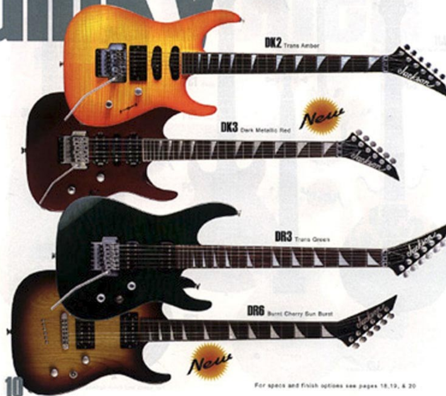
DK2 Trans Amber