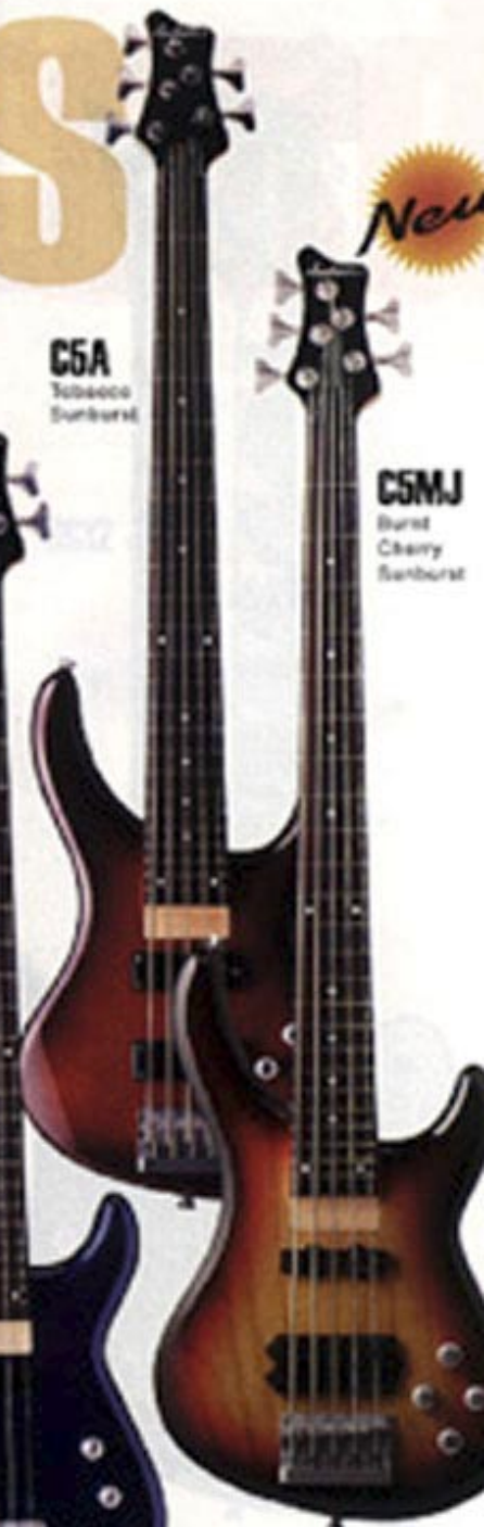
C5A Tobacco Sunburst