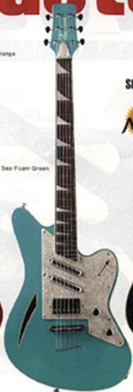
SC3 Sea Foam Green