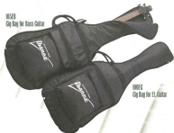
RG4700 Gig Bag for Bass Guitar