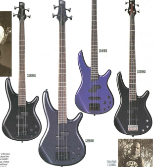
Steve Youth 7.13.08MS