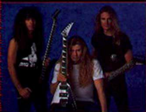
MARTY, DAVE AND DAVE - MEGADETH