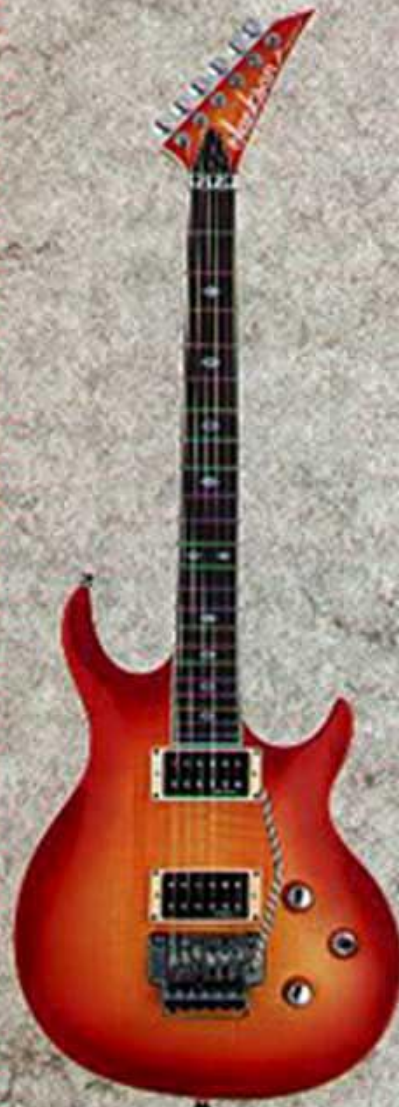
Infinity Pro BODY: SHIMMER MAPLE TOP NECK: MAPLE FINGERBOARD: ROXOLITE SCALE: 25.5" (24 fret) BRIDGE: 17.5" DOUBLE LOCKING CONTROLS: VOLUME, TONE, 3-WAY SWITCH PICKUPS: 2x JAZZ FINISH: 2x COAT OF V.P.