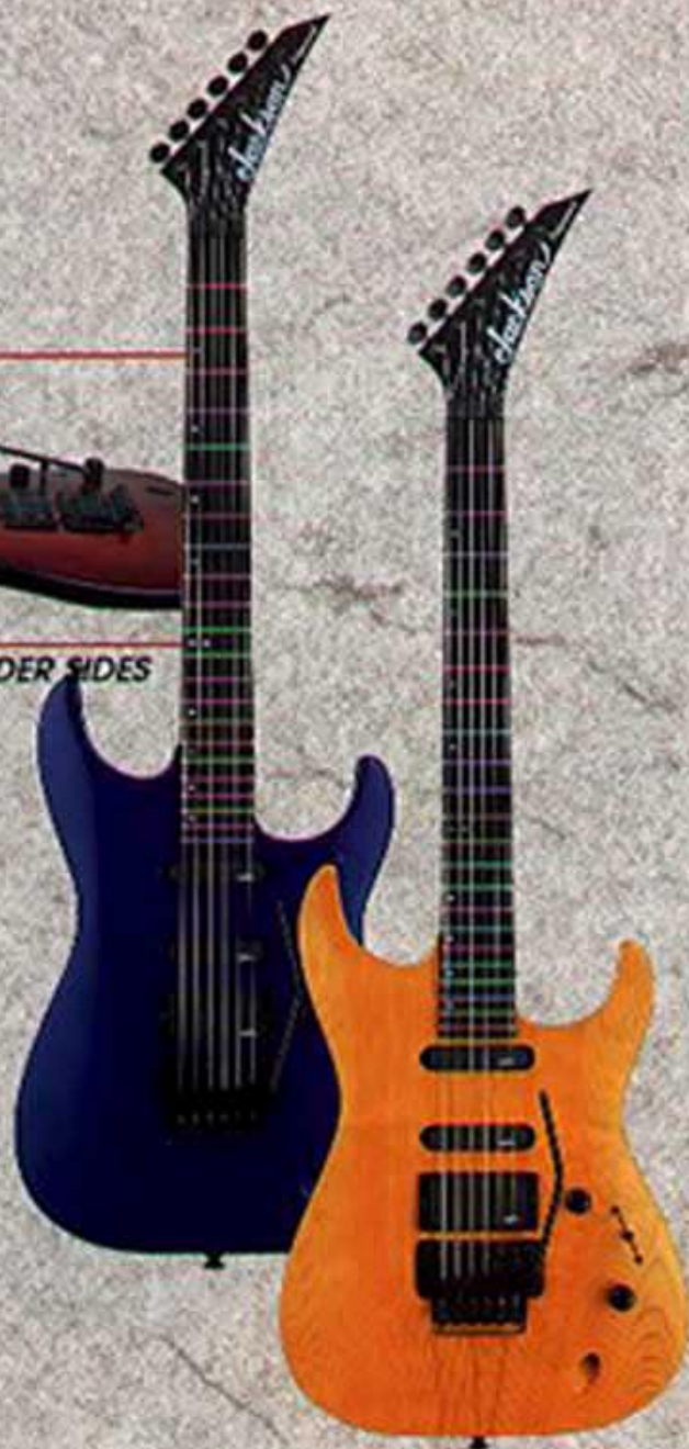
Stealth XL BODY: BASSWOOD NECK: BASSWOOD FINGERBOARD: ROXOLITE SCALE: 25.5" (24 fret) BRIDGE: 17.5" DOUBLE LOCKING CONTROLS: VOLUME, TONE, 3-WAY SWITCH, SHUNT SWITCH ELECTRONICS: 2x JAZZ PICKUPS: 2x JAZZ FINISH: 2x COAT OF V.P.