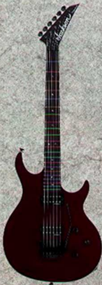
Infinity XL BODY: BASSWOOD NECK: BASSWOOD FINGERBOARD: ROXOLITE SCALE: 25.5" (24 fret) BRIDGE: 17.5" DOUBLE LOCKING CONTROLS: VOLUME, TONE, 3-WAY SWITCH PICKUPS: 2x JAZZ FINISH: 2x COAT OF V.P.

The Infinity LT shares the same shape, but with a Basswood body and bolt on neck. The Infinity XL features a bound top and obsolete dot markers to highlight its understated good looks. The pickups in both Infinity Models are specially wound to enhance the warm tone of this new body shape.