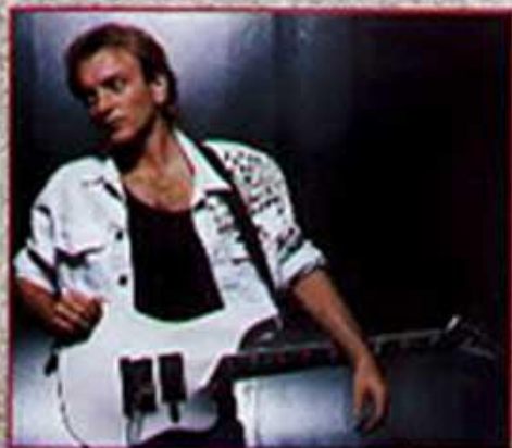
PHIL COLLEN - DEF LEPPARD

The Phil Collen model represents yet another completely innovative Jackson design. Its highly sculpted body offers a unique look while offering excellent access to the upper frets. Like Jackson's other neck thru body designs the Collen offers excellent stability and sustain. The sound is further enhanced by using an Ebony fingerboard which tends to bring out all of the strings harmonics and belliance.