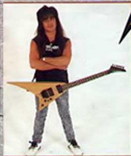
DAN SPITZ - ANTHRAX