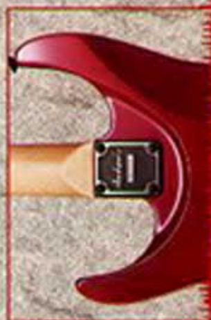
FULL CUT HEEL

NECK: 100MS INDEXERS: 4/11/17/24 SERRANO SWITCH