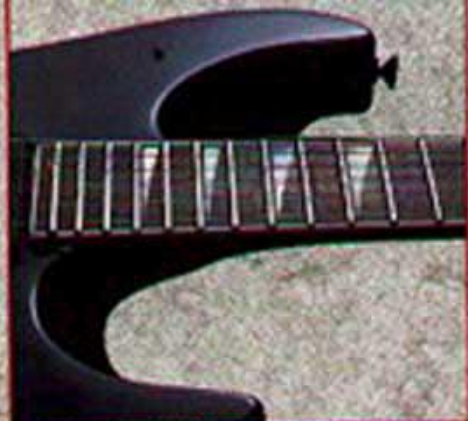
NECK THRU CONSTRUCTION