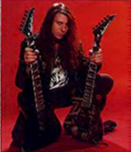
CRISS OLIVA - SAVATAGE