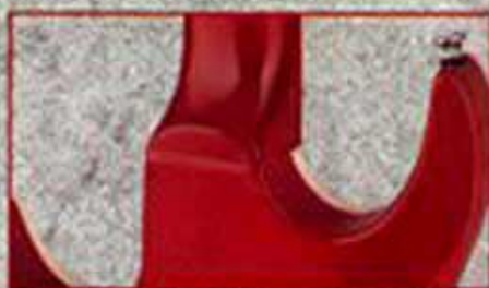
SET NECK CONSTRUCTION