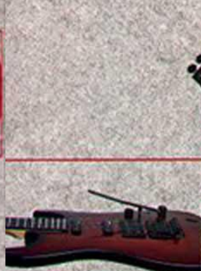
SLEEK AND SLENDER SIDES