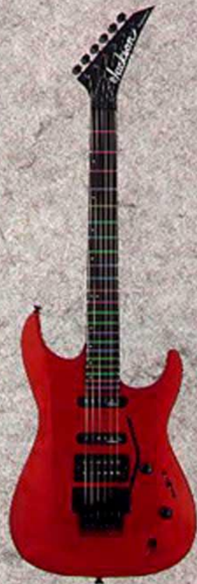
Stealth LT BODY: SHIMMER MAPLE TOP NECK: MAPLE FINGERBOARD: ROXOLITE SCALE: 25.5" (24 fret) BRIDGE: 17.5" DOUBLE LOCKING CONTROLS: VOLUME, TONE, 3-WAY SWITCH PICKUPS: 2x JAZZ FINISH: 2x COAT OF V.P.

Take a Dinky body, sculpt the front and back so that you have an ultra sleek looking and feeling body, and you have the Stealth. The result is a light weight guitar with an extremely powerful sonic character. The Stealth Pro features an ebony fingerboard for aggressive mid range and highs, while the Stealth XL and LT models come equipped with a rosewood fingerboard for a warmer overall response. Either way, the Stealth is an amazingly comfortable guitar with a lot to offer any style of music.