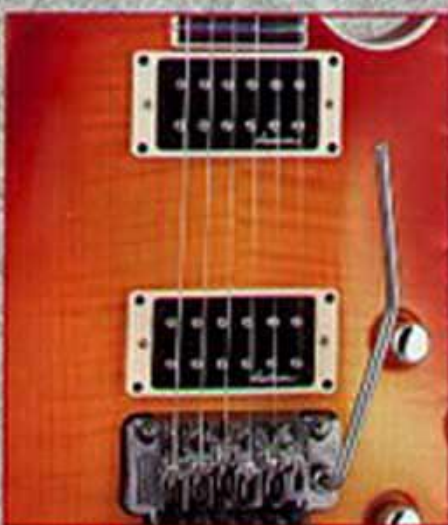
ARCHED FLAME MAPLE TOP