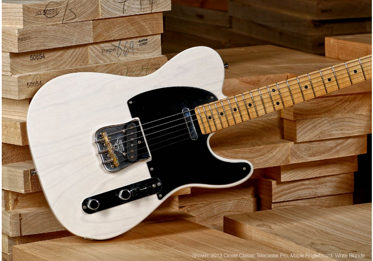
Shown: 2013 Closet Classic Telecaster Pro, Maple Fingerboard, White Blonde