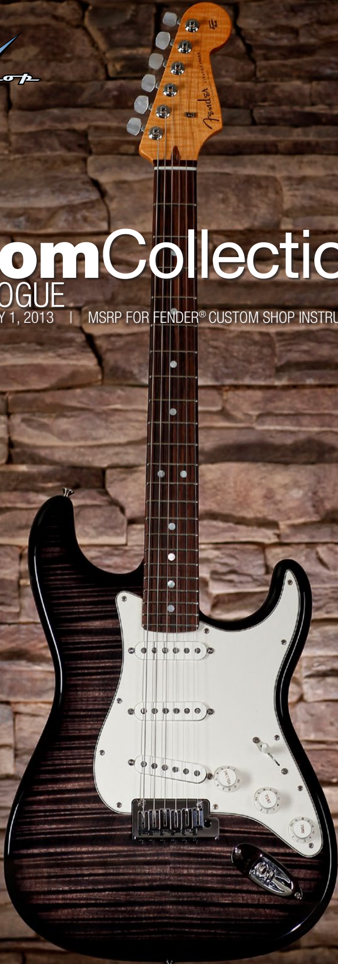
Shown: 2013 Custom Deluxe Stratocaster®, Rosewood Fingerboard, Ebony Transparent

PRICES EFFECTIVE JANUARY 1, 2013 | MSRP FOR FENDER® CUSTOM SHOP INSTRUMENTS