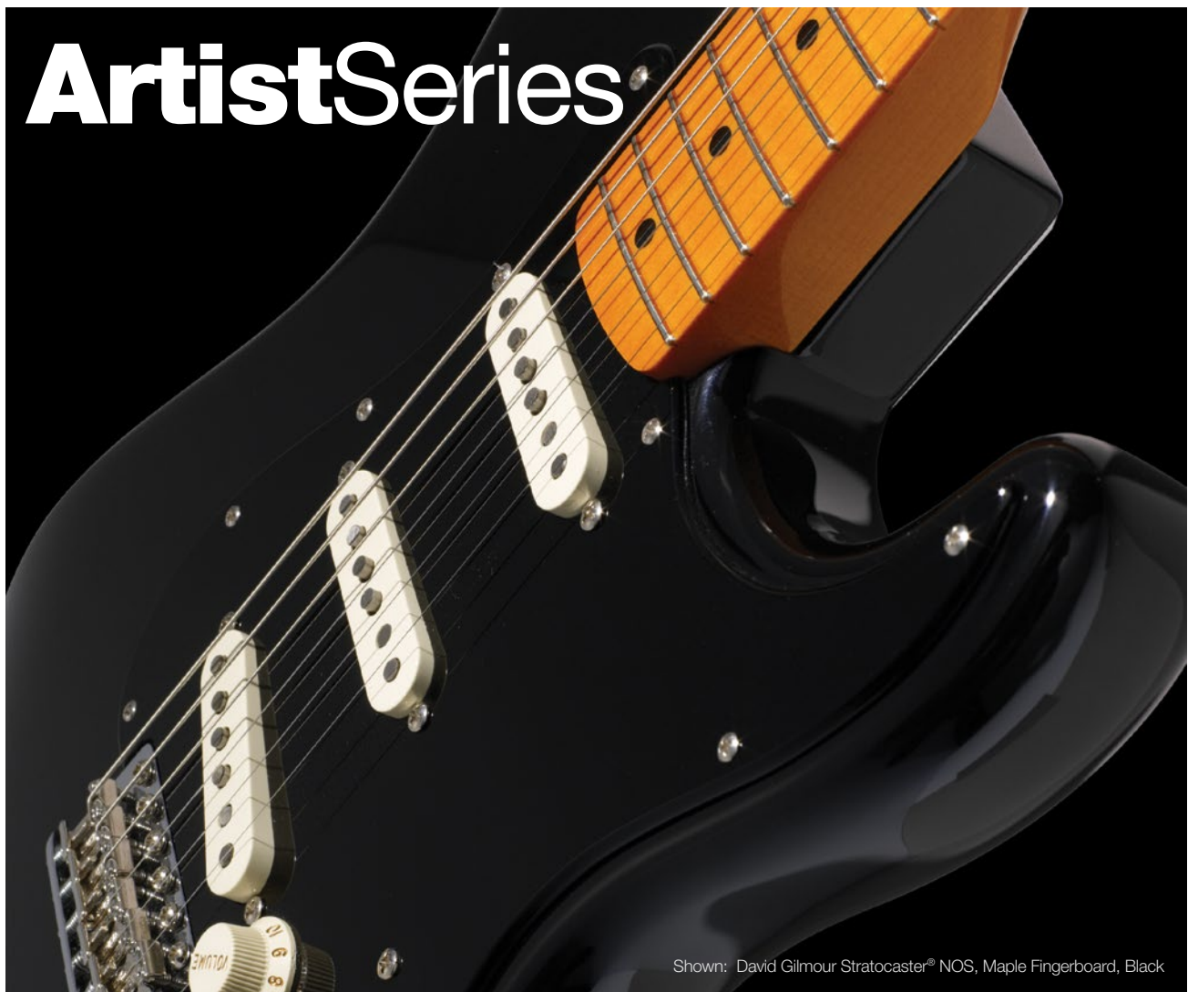
Shown: David Gilmour Stratocaster® NOS, Maple Fingerboard, Black