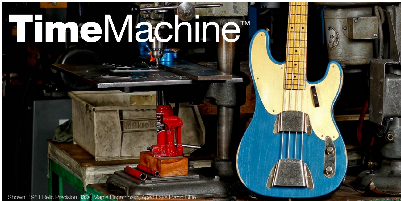
Shown: 1951 Relic Precision Bass, Maple Fingerboard, Aged Lake Placid Blue