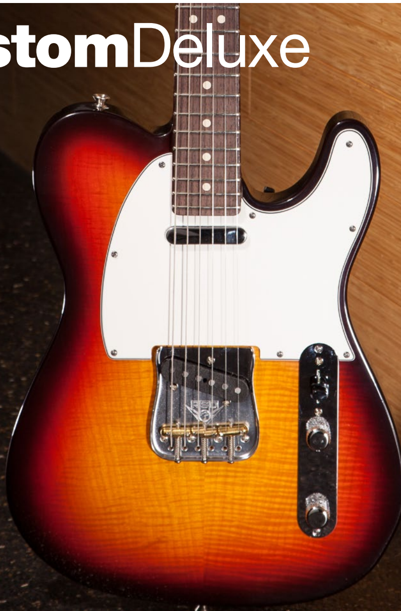
Shown: 2013 Custom Deluxe Telecaster, Rosewood Fingerboard, Faded 3-Color Sunburst