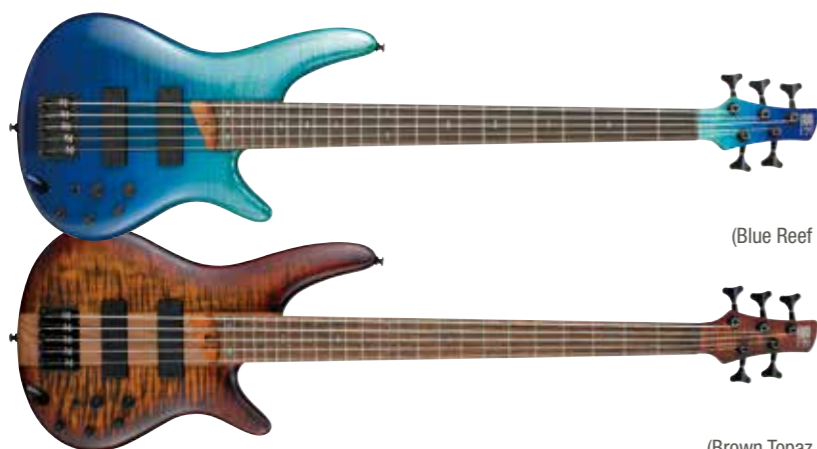
BRG (Blue Reef Gradation)