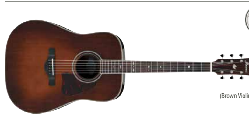
BVS (Brown Violin Sunburst)