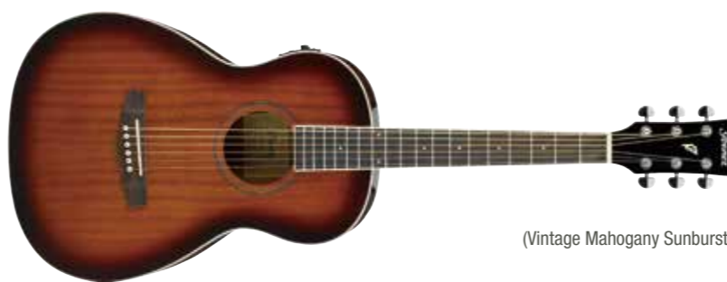
VMS (Vintage Mahogany Sunburst High Gloss)