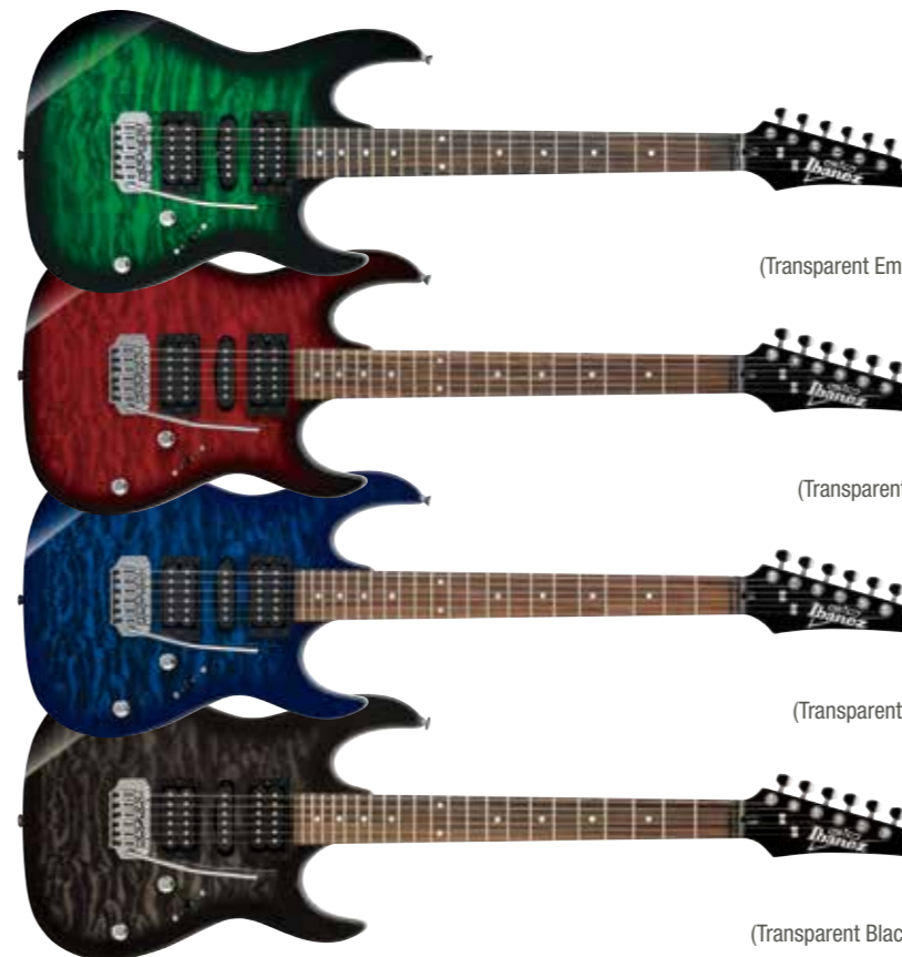
TEB (Transparent Emerald Burst)