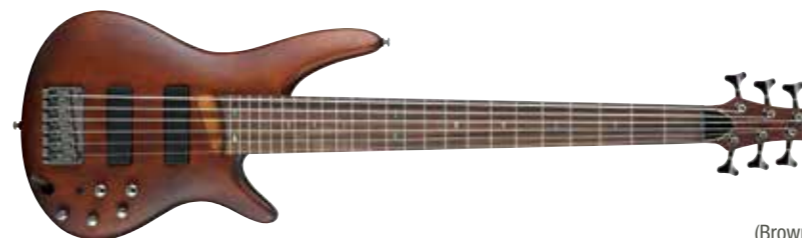
BM (Brown Mahogany)