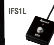
Sold Separately 1Channel Latching footswitch