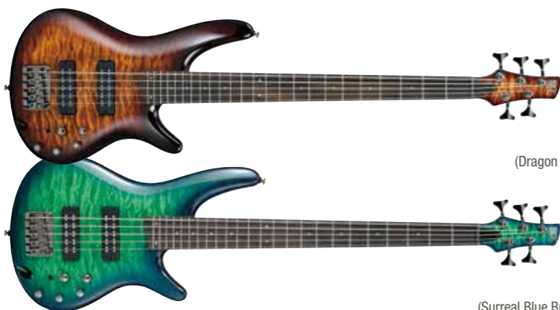
DEB (Dragon Eye Burst)