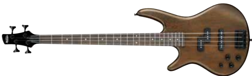
WNF (Walnut Flat)