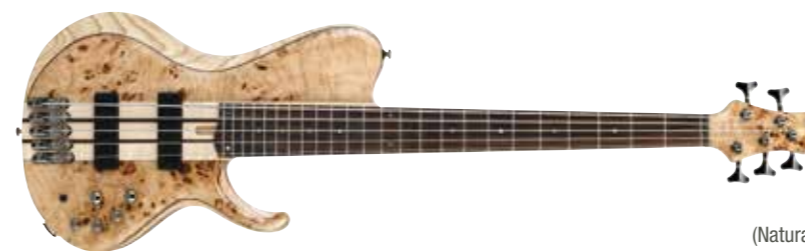
NTL (Natural Low Gloss)