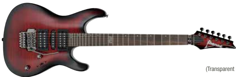
TRB (Transparent Red Burst)