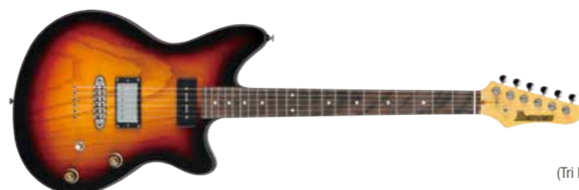
TFB (Tri Fade Burst)