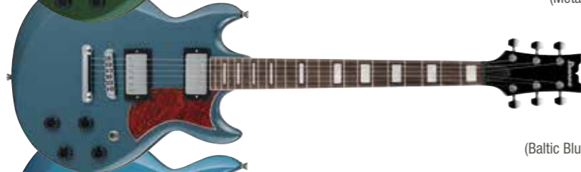
BEM (Baltic Blue Metallic)