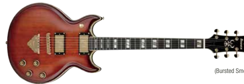
BSQ (Bursted Smoky Quartz)