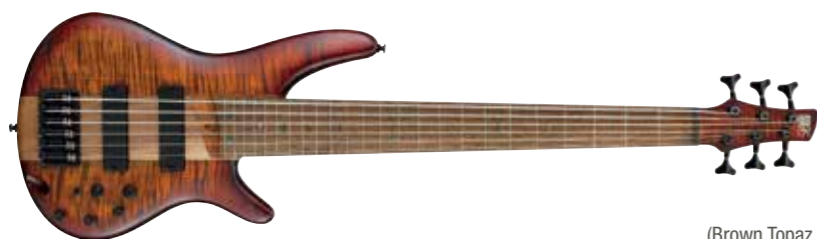
BTF (Brown Topaz Burst Flat)