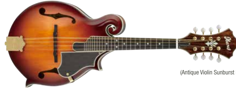
AVS (Antique Violin Sunburst High Gloss)