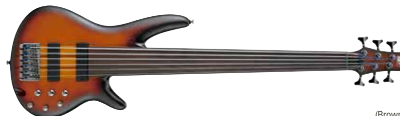
BBF (Brown Burst Flat)