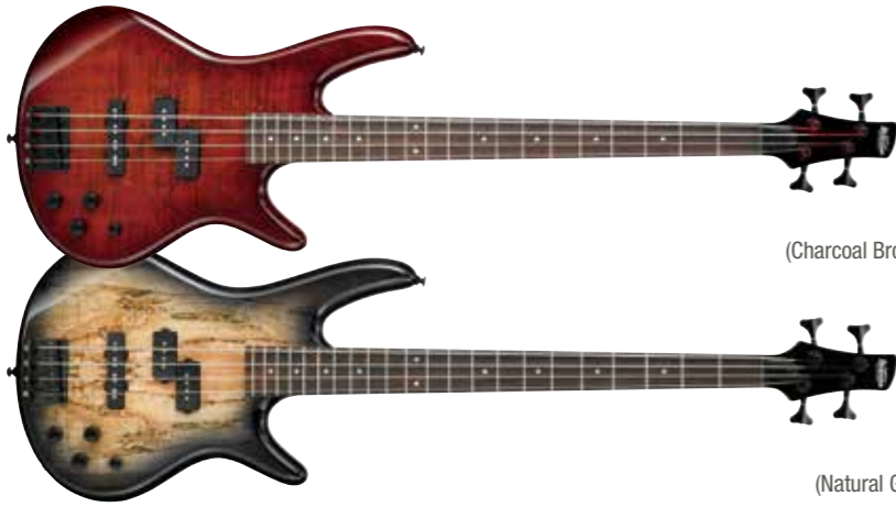
CNB (Charcoal Brown Burst)