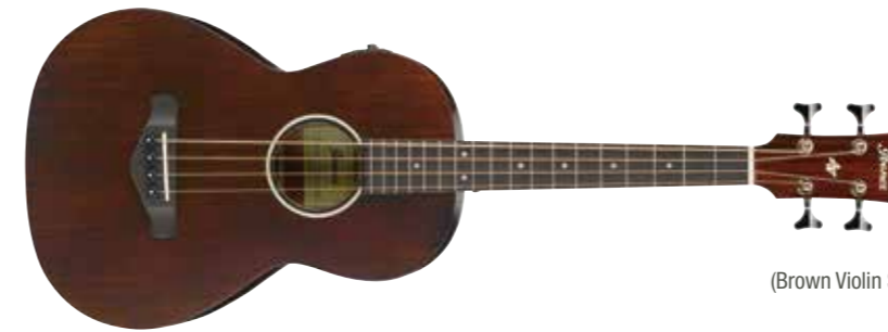
BV (Brown Violin Semi-Gloss)