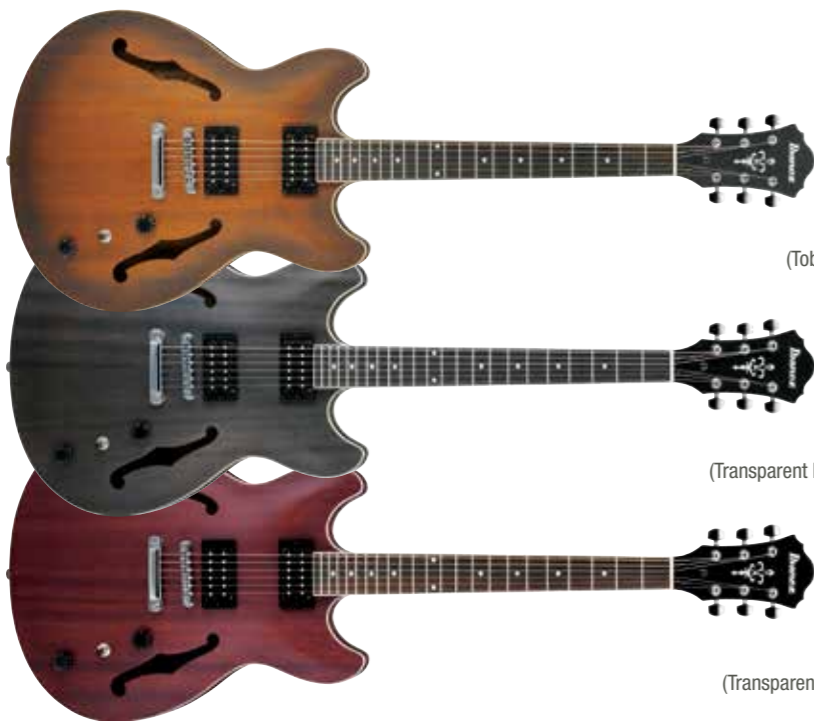
TF (Tobacco Flat)