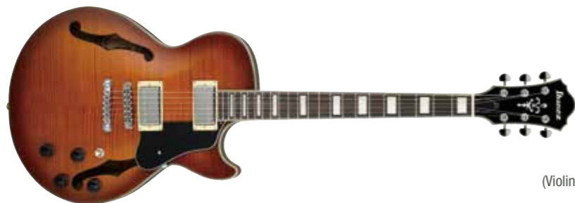
VLS (Violin Sunburst)