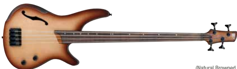
NNF (Natural Browned Burst Flat)