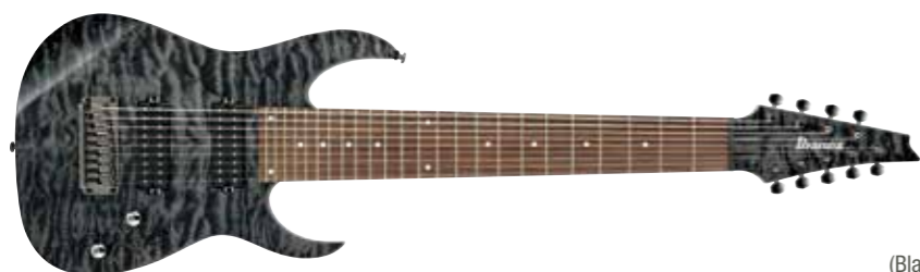
BI (Black Ice)