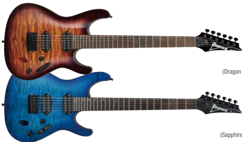
DEB (Dragon Eye Burst)