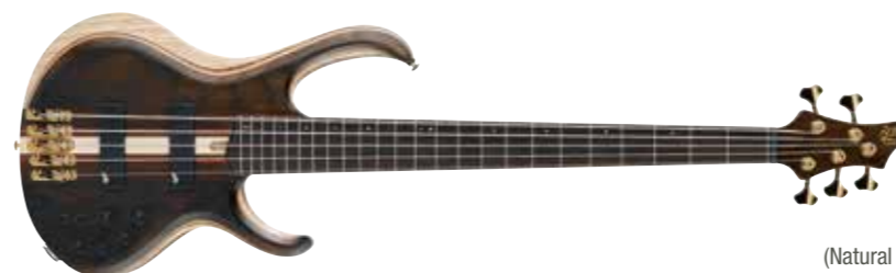
Premium NTL (Natural Low Gloss)