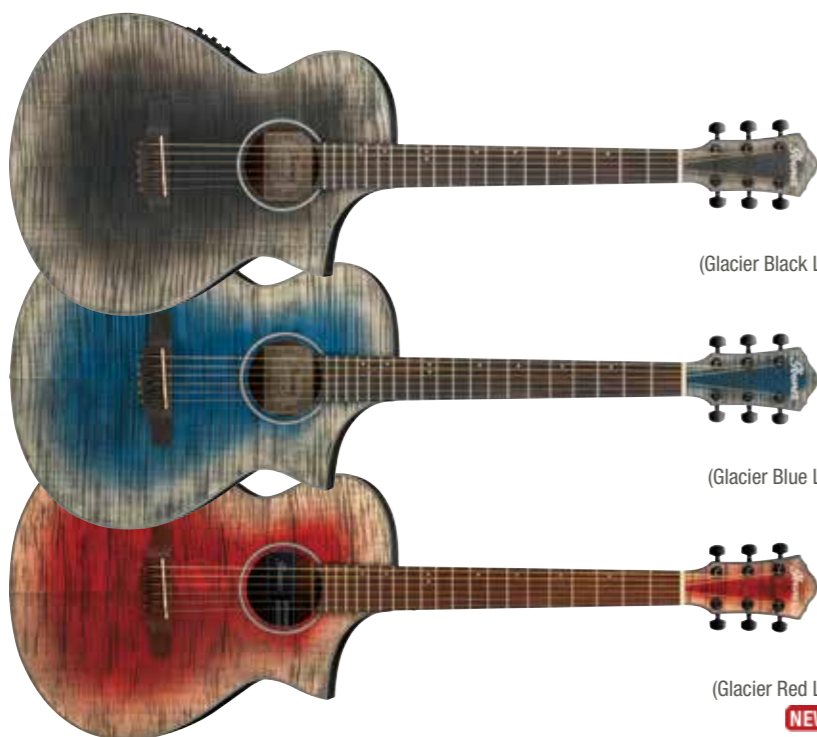
GBK (Glacier Black Low Gloss)