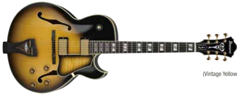
VYS (Vintage Yellow Sunburst)