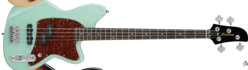
MGR (Mint Green)