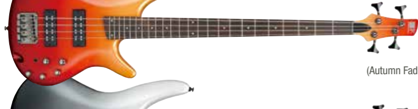
AFM (Autumn Fade Metallic)