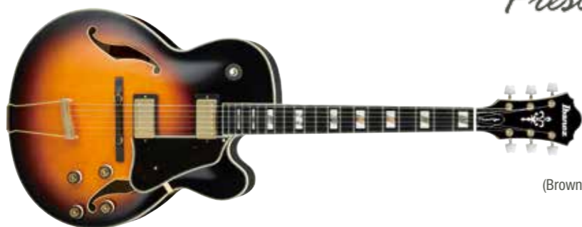
BS (Brown Sunburst)