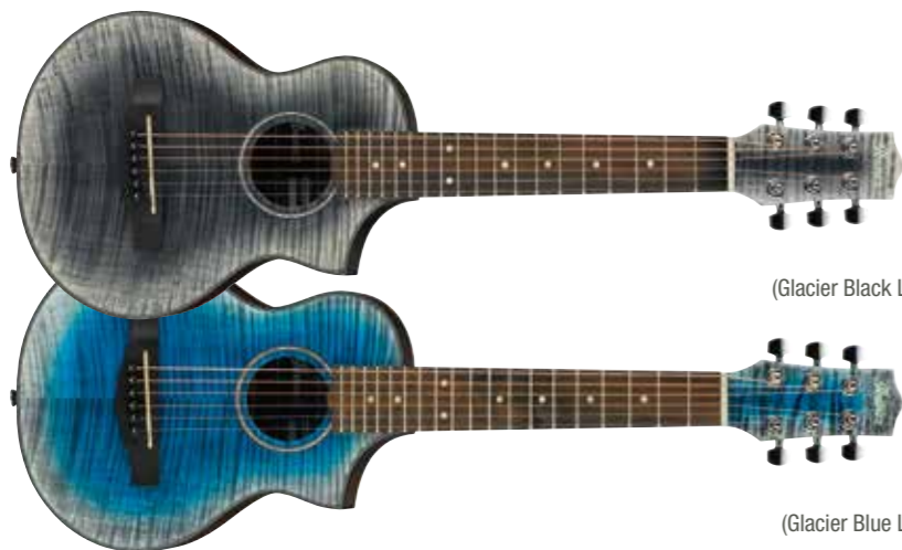
GBK (Glacier Black Low Gloss)