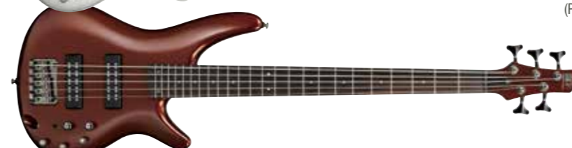
RBM (Root Beer Metallic)