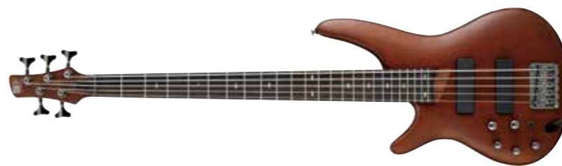
BM (Brown Mahogany)