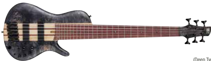
DTF (Deep Twilight Flat)