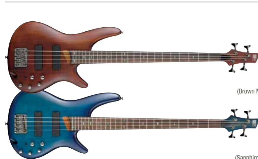
BM (Brown Mahogany)