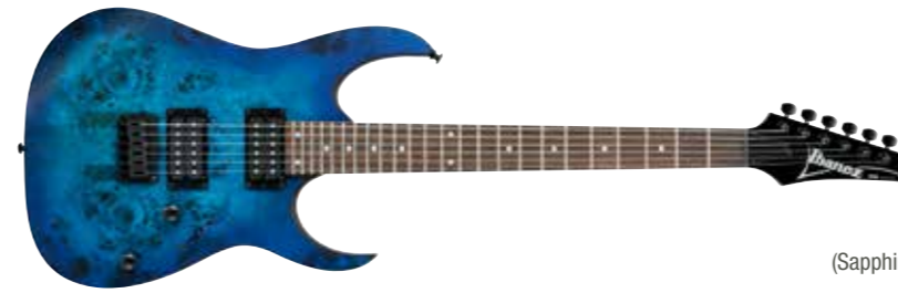
SBF (Sapphire Blue Flat)