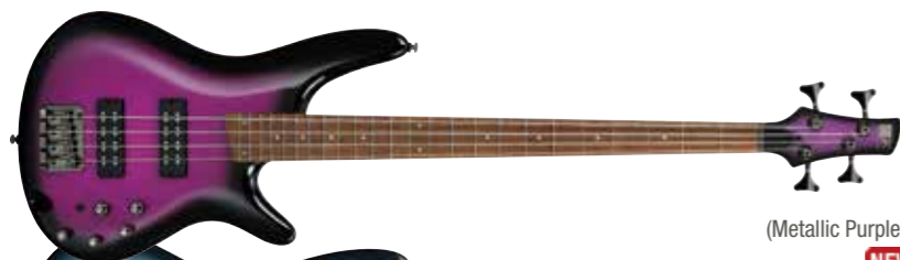
MPS (Metallic Purple Sunburst) NEW FINISH