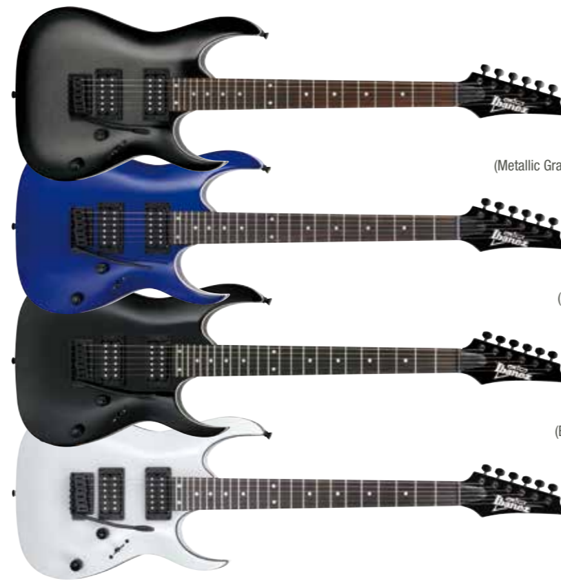
MGS (Metallic Gray Sunburst)