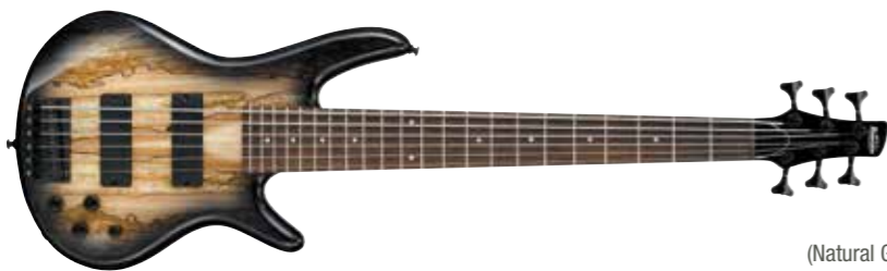
NGT (Natural Gray Burst)