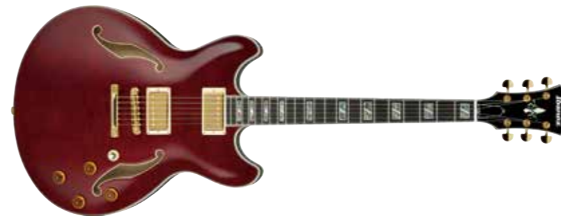
WRD (Wine Red)