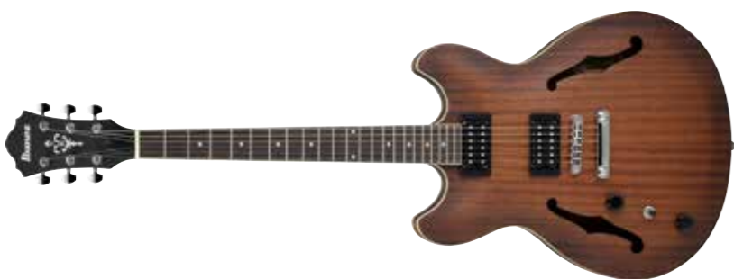
TF (Tobacco Flat)