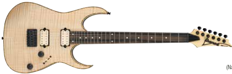
NTF (Natural Flat)