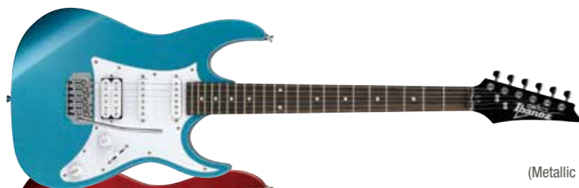
MLB (Metallic Light Blue)