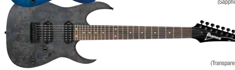
TGF (Transparent Gray Flat)