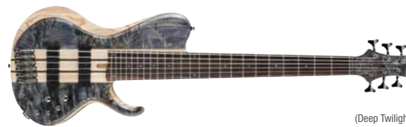
DTL (Deep Twilight Low Gloss)