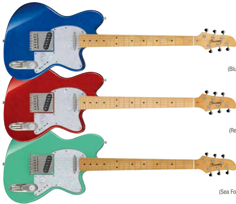
BSP (Blue Sparkle)