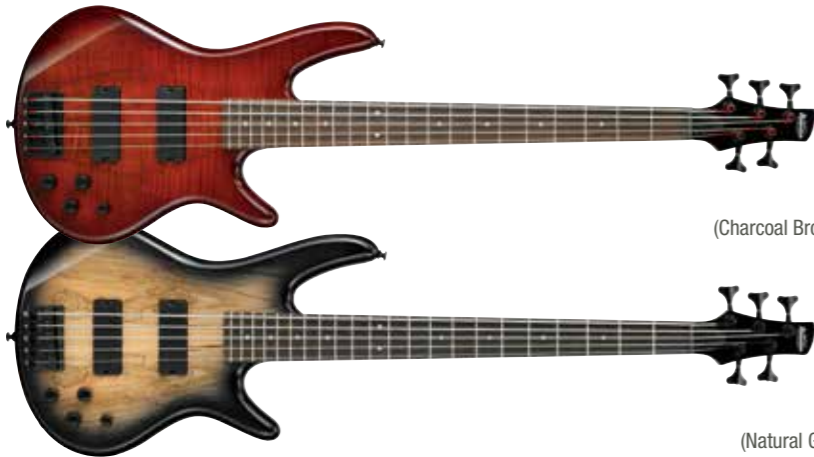
CNB (Charcoal Brown Burst)