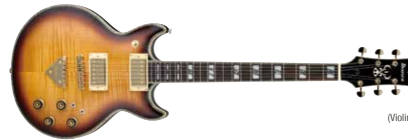
VLS (Violin Sunburst)