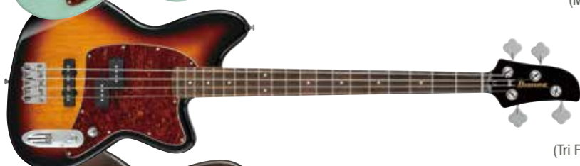
TFB (Tri Fade Burst)