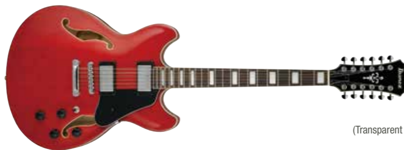
TCD (Transparent Cherry Red)