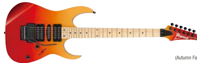
AFM (Autumn Fade Metallic)