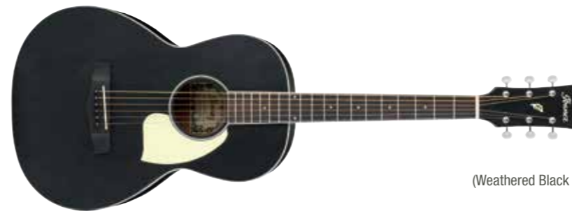
WK (Weathered Black Open Pore)