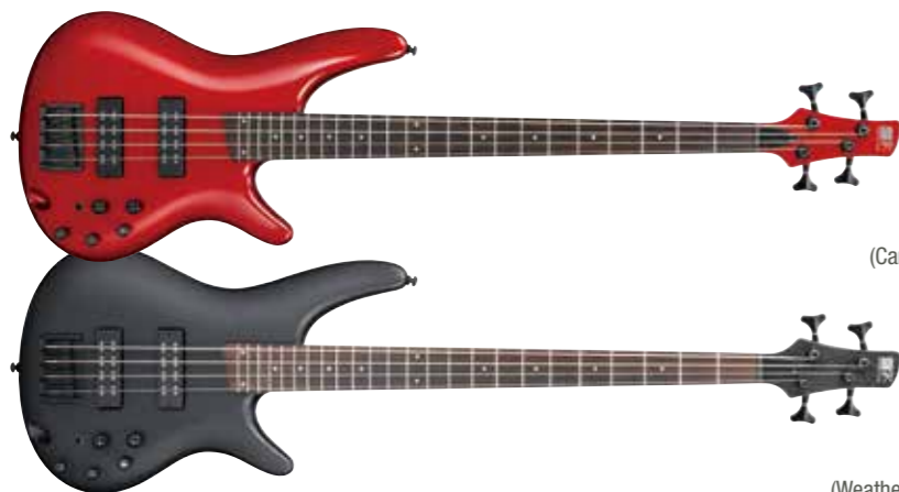
CA (Candy Apple)