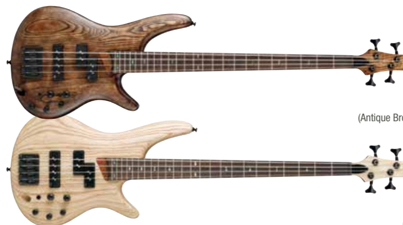
ABS (Antique Brown Stained)