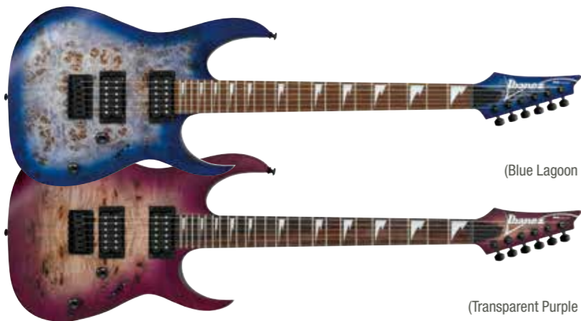
BLF (Blue Lagoon Burst Flat)