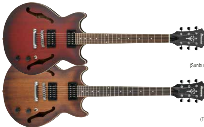
SRF (Sunburst Red Flat)