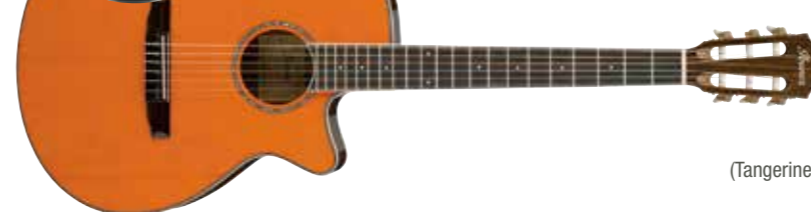
TNG (Tangerine High Gloss)