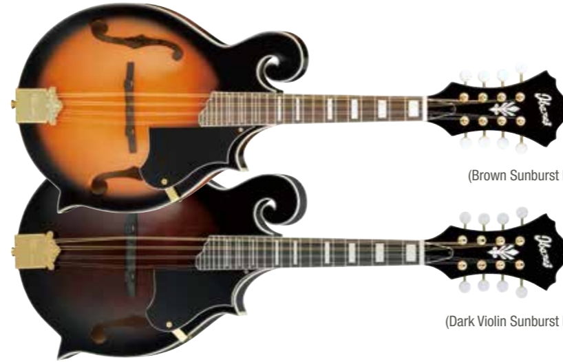
BS (Brown Sunburst High Gloss)