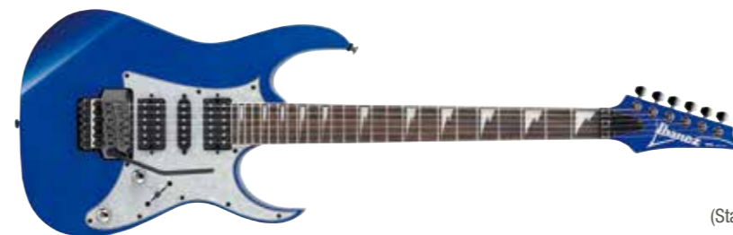
SLB (Starlight Blue)