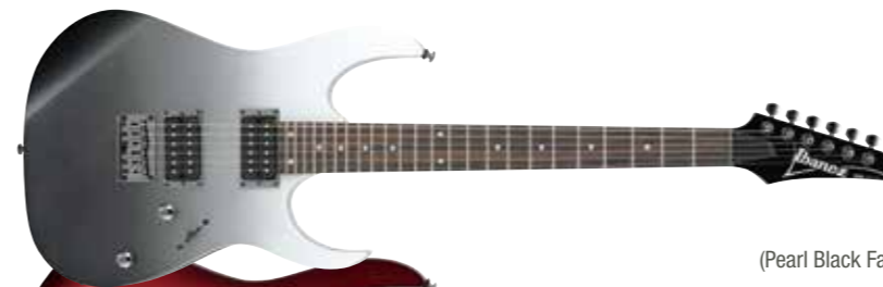
PFM (Pearl Black Fade Metallic)