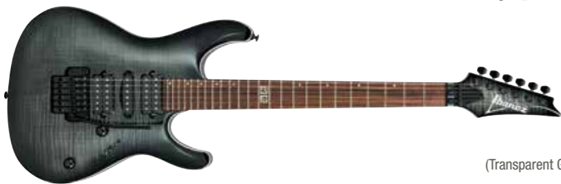
TGB (Transparent Gray Burst)