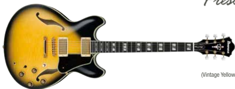
VYS (Vintage Yellow Sunburst)