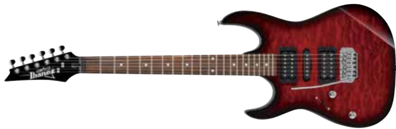
TRB (Transparent Red Burst)