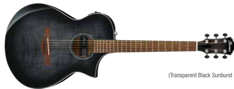
TKS (Transparent Black Sunburst High Gloss)