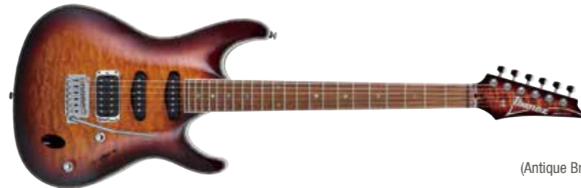
ABB (Antique Brown Burst)