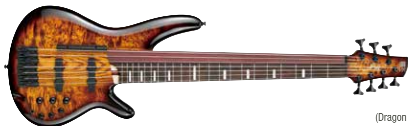
DEB (Dragon Eye Burst)