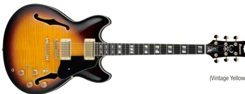
VYS (Vintage Yellow Sunburst)