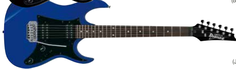
JB (Jewel Blue)