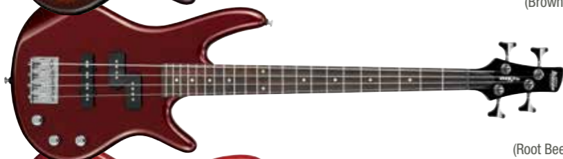
RBM (Root Beer Metallic)