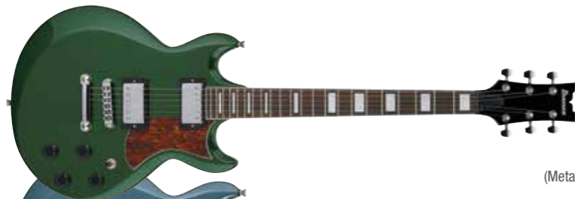
MFT (Metallic Forest)