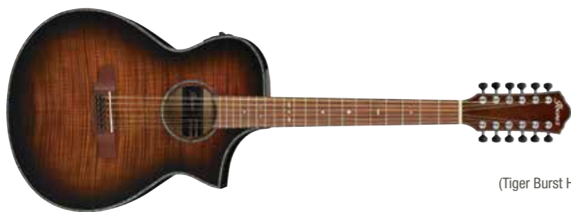
TIB (Tiger Burst High Gloss)