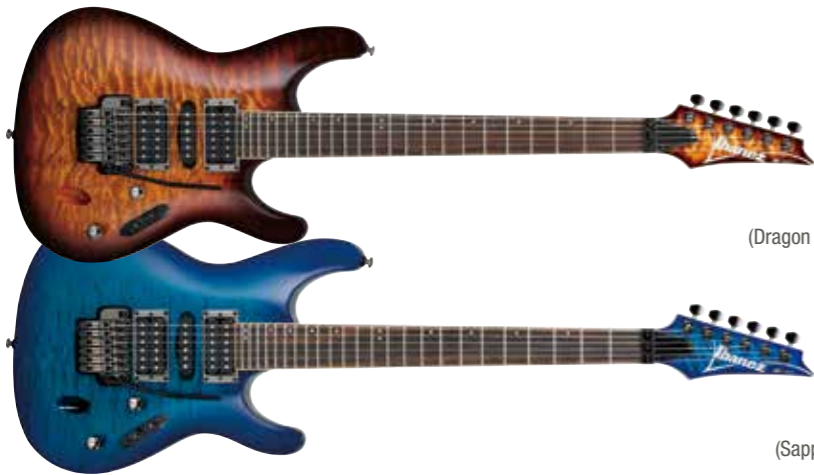
DEB (Dragon Eye Burst)