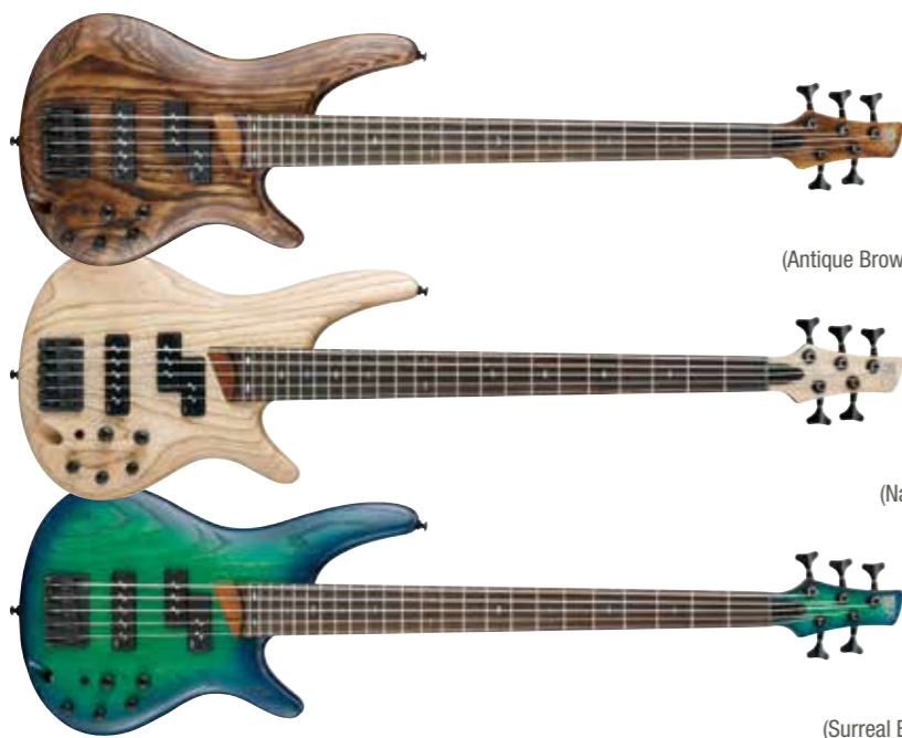
ABS (Antique Brown Stained)