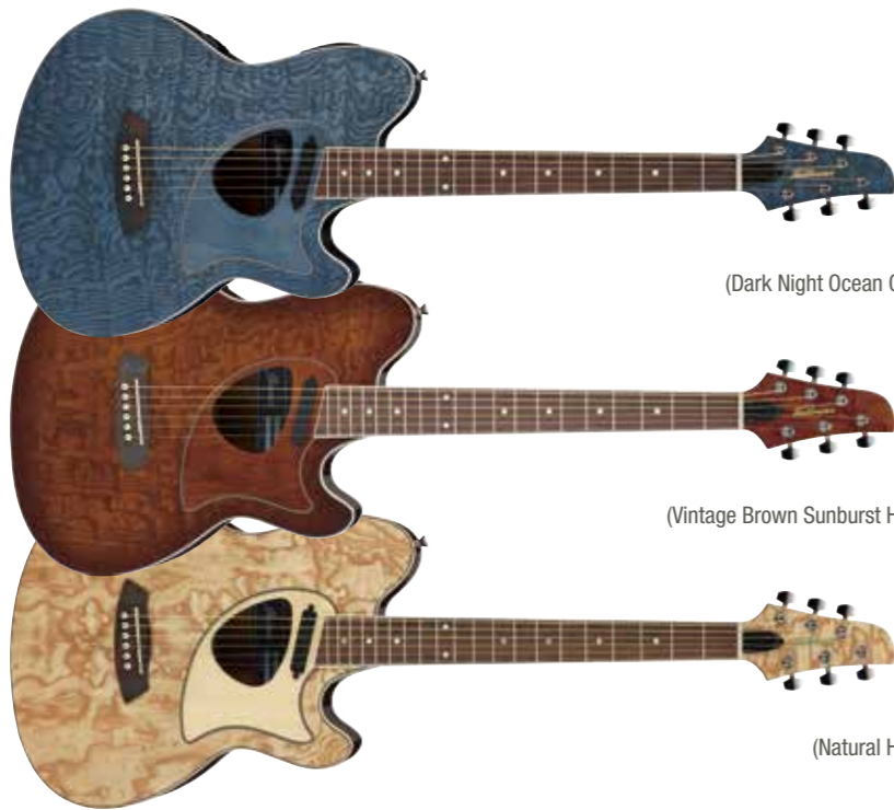
DNO (Dark Night Ocean Open Pore)