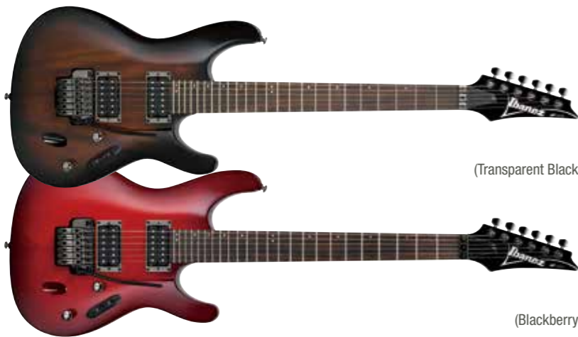
TKS (Transparent Black Sunburst)