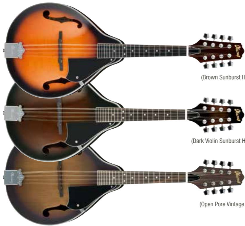
BS (Brown Sunburst High Gloss)