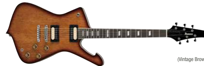
VBS (Vintage Brown Sunburst)