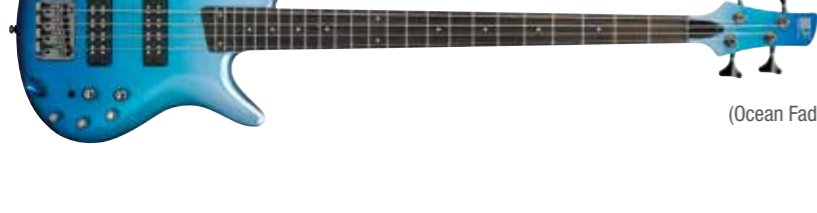
OFM (Ocean Fade Metallic)