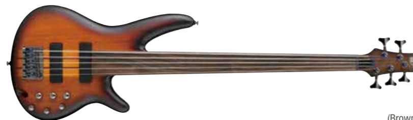
BBF (Brown Burst Flat)