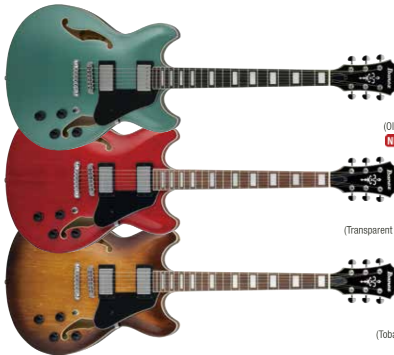
OLM (Olive Metallic) NEW FINISH