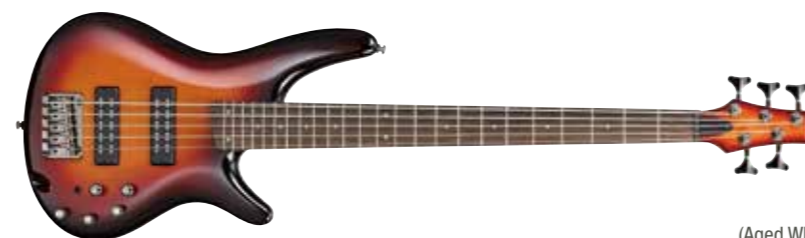
AWB (Aged Whiskey Burst)