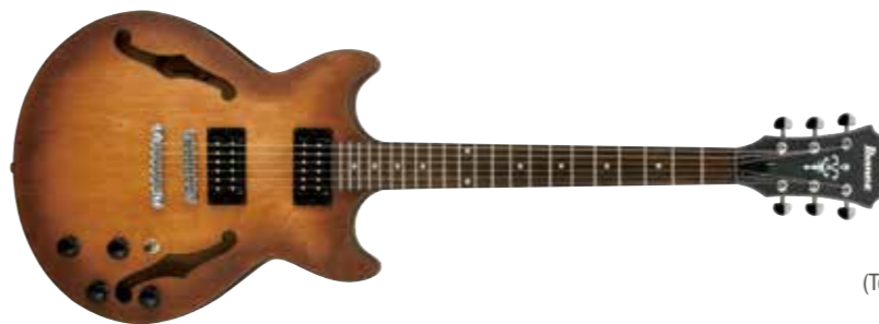
TF (Tobacco Flat)