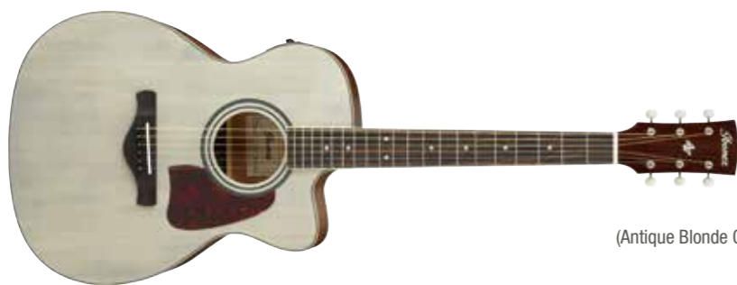
ABL (Antique Blonde Open Pore)