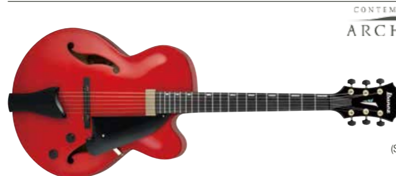
SRR (Sunrise Red)