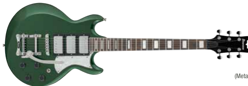
MFT (Metallic Forest)