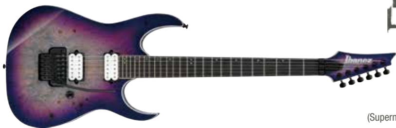
SNB (Supernova Burst)