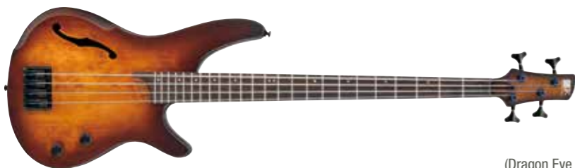
DEF (Dragon Eye Burst Flat)