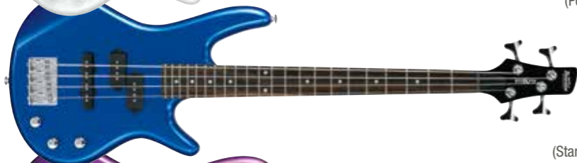
SLB (Starlight Blue)