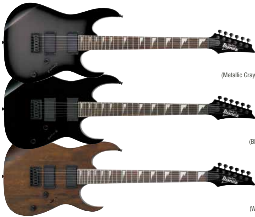
MGS (Metallic Gray Sunburst)