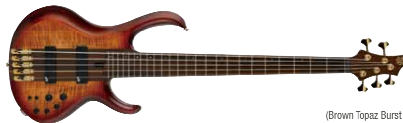
Premium BTL (Brown Topaz Burst Low Gloss)