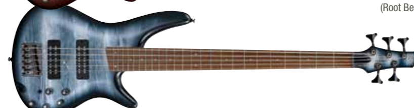
BPM (Black Planet Matte) NEW FINISH