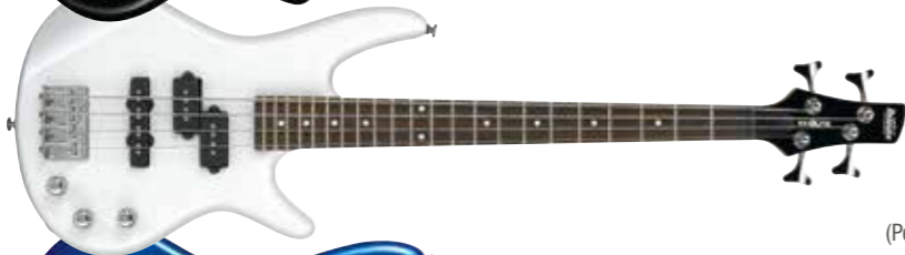
PW (Pearl White)