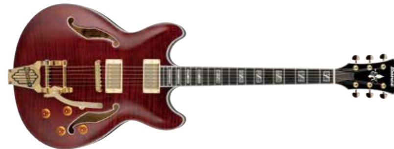
WRD (Wine Red)