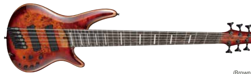
BTT (Brown Topaz Burst)