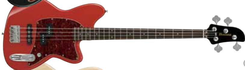
CRD (Coral Red)