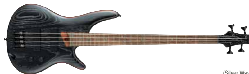
SKF (Silver Wave Black Flat)