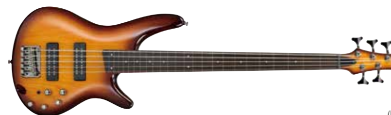
BBT (Brown Burst)