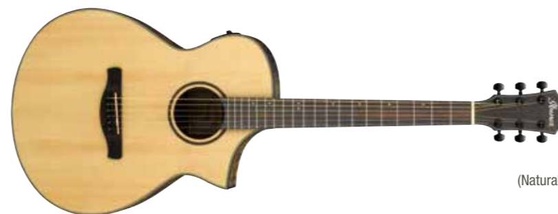
LG (Natural Low Gloss)