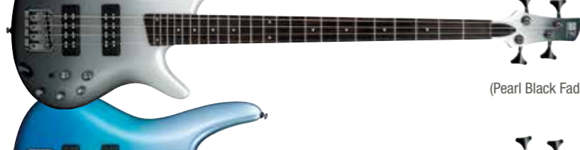
PFM (Pearl Black Fade Metallic)