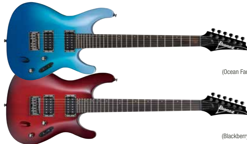
OFM (Ocean Fade Metallic)