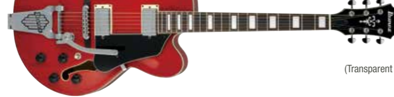
TCD (Transparent Cherry Red)