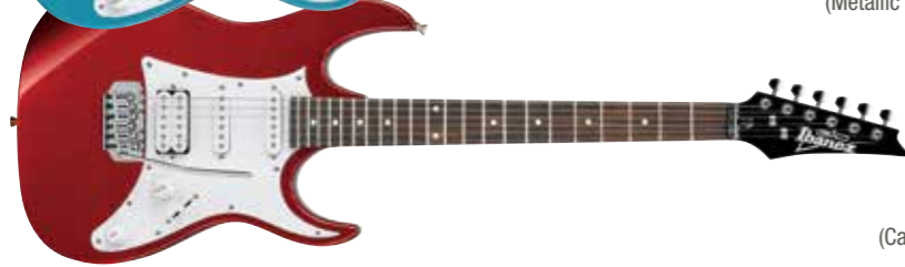
CA (Candy Apple)