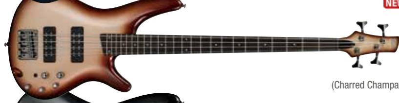
CCB (Charred Champagne Burst)