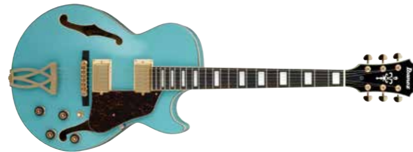
MTB (Mint Blue)