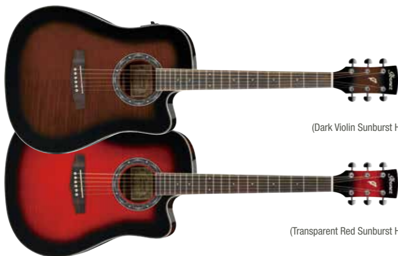
DVS (Dark Violin Sunburst High Gloss)