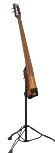
MOB (Mahogany Oil Burst)