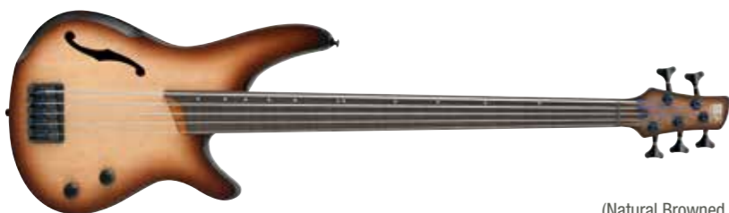
NNF (Natural Browned Burst Flat)