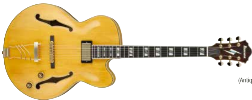
AA (Antique Amber)