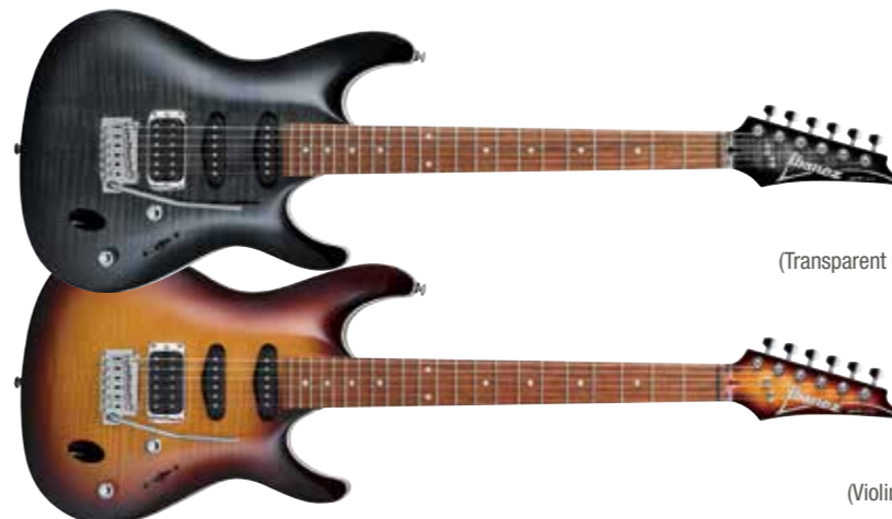
TGB (Transparent Gray Burst)