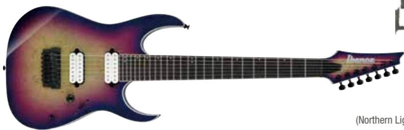
NLB (Northern Lights Burst)