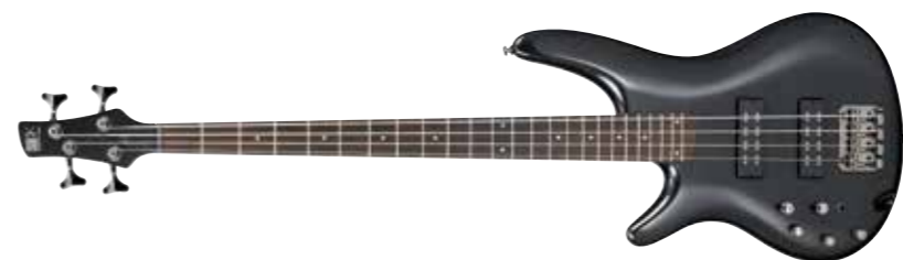
IPT (Iron Pewter)