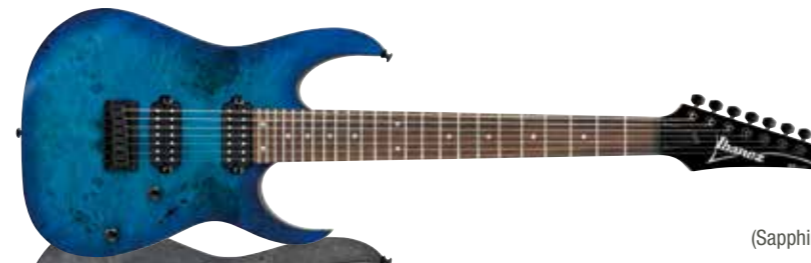
SBF (Sapphire Blue Flat)