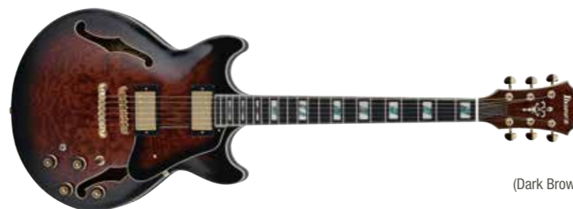
DBS (Dark Brown Sunburst)