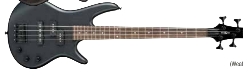
WK (Weathered Black)