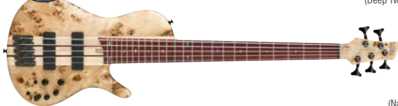
NTF (Natural Flat)