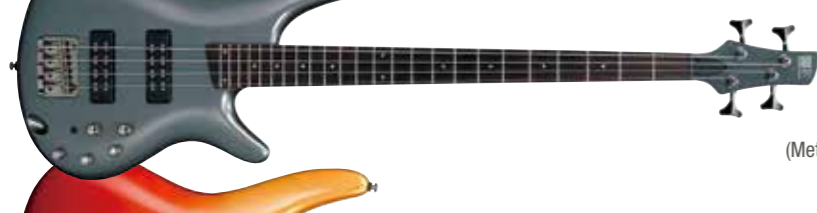
MG (Metallic Gray)