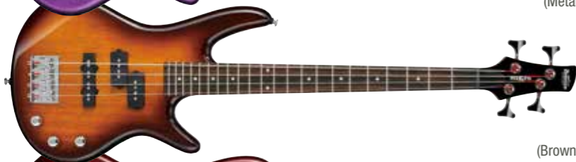
BS (Brown Sunburst)