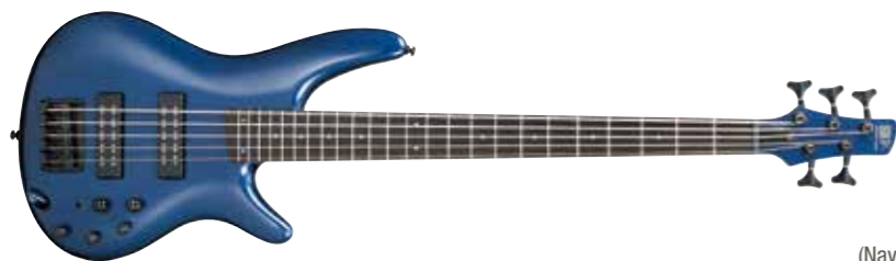
NM (Navy Metallic)