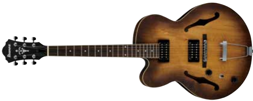
TF (Tobacco Flat)