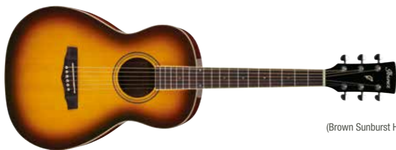
BS (Brown Sunburst High Gloss)