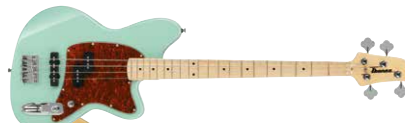
MGR (Mint Green)