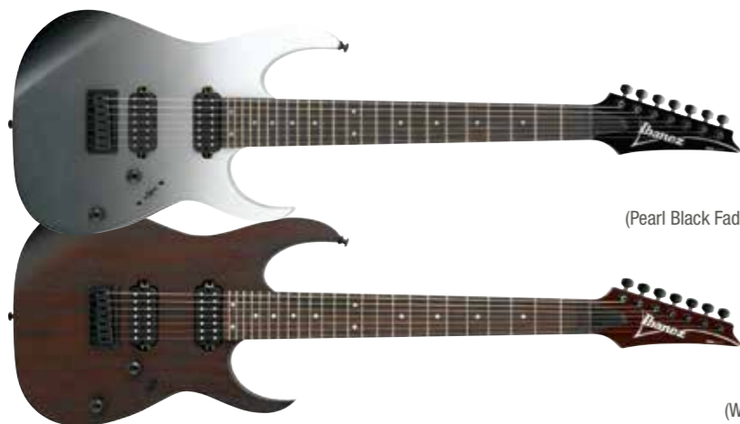
PFM (Pearl Black Fade Metallic)