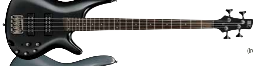
IPT (Iron Pewter)