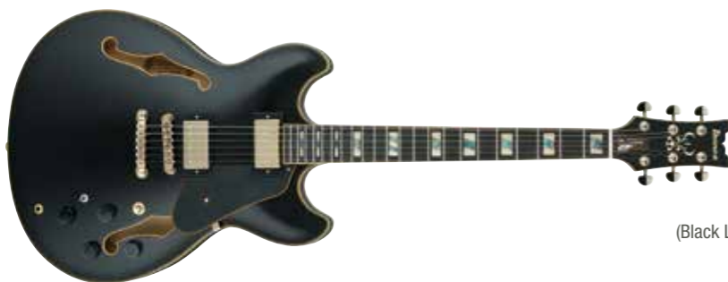
BKL (Black Low Gloss)