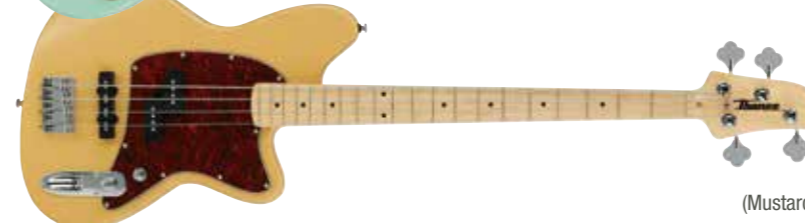
MWF (Mustard Yellow Flat)