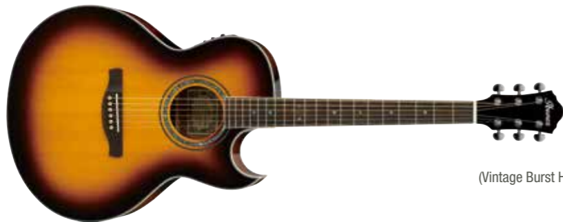
VB (Vintage Burst High Gloss)