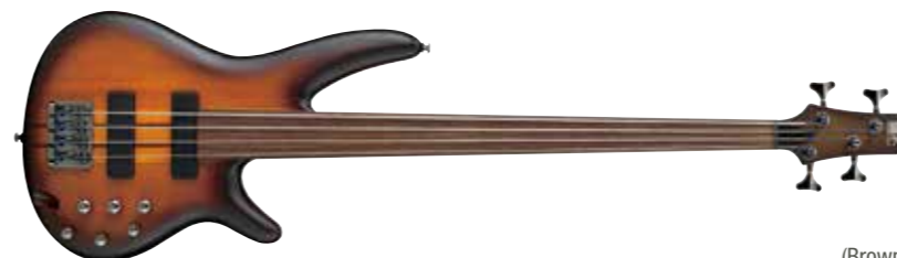
BBF (Brown Burst Flat)