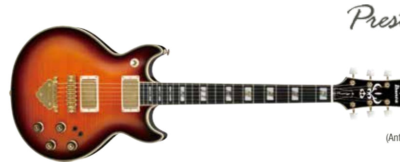
AV (Antique Violin)