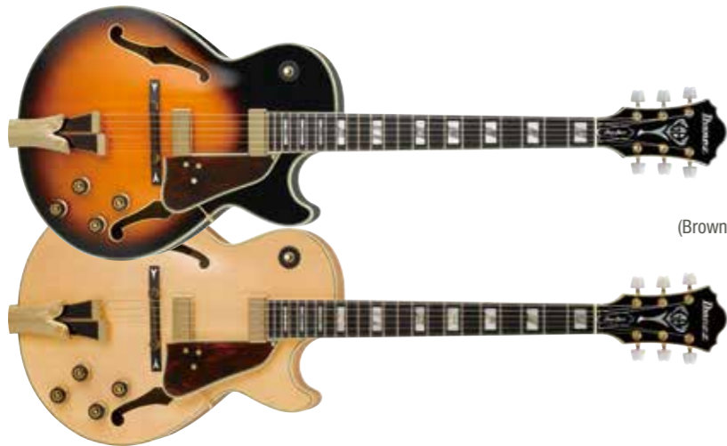
BS (Brown Sunburst)