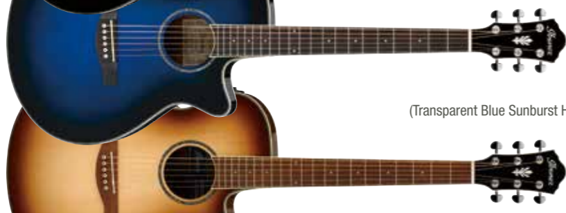
TBS (Transparent Blue Sunburst High Gloss)