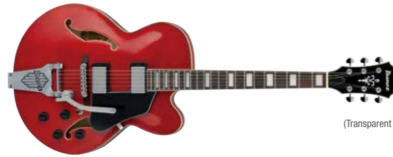
TCD (Transparent Cherry Red)