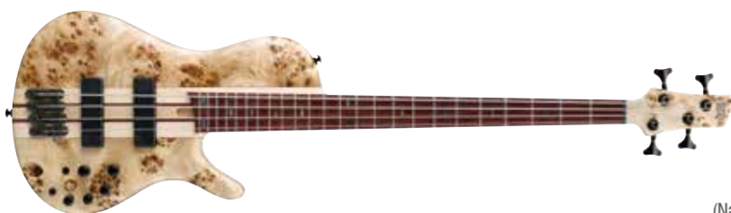
NTF (Natural Flat)