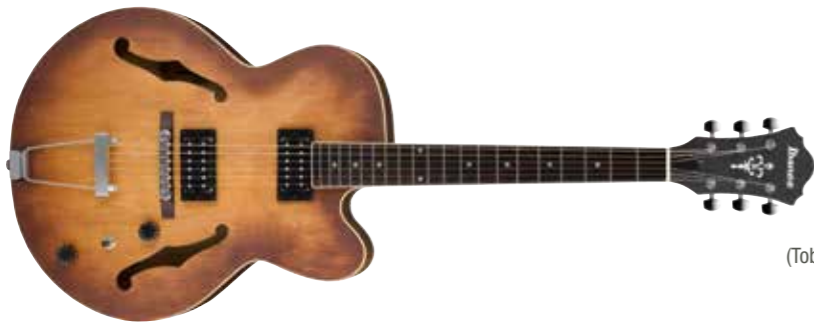
TF (Tobacco Flat)