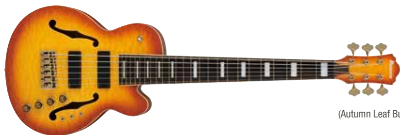
ALM (Autumn Leaf Burst Matte)