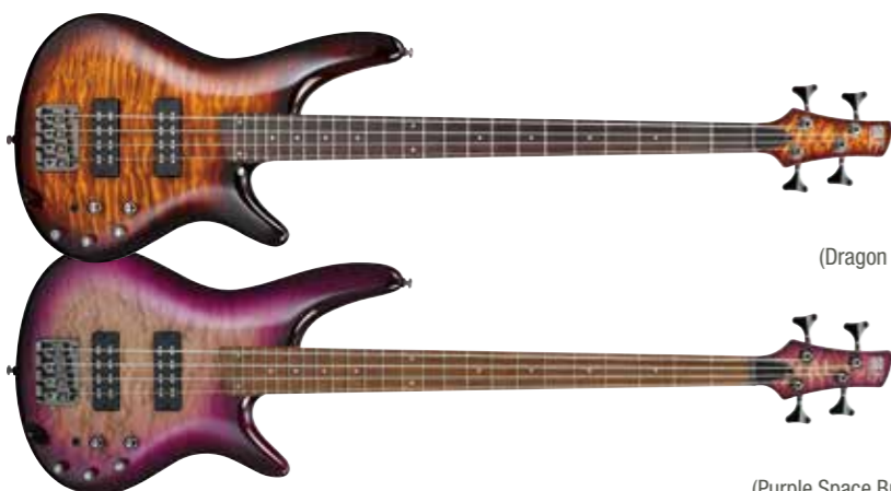
DEB (Dragon Eye Burst)