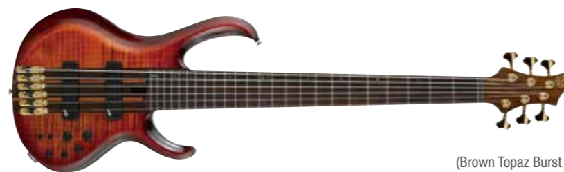
Premium BTL (Brown Topaz Burst Low Gloss)