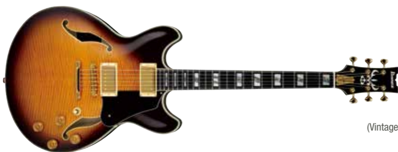
VT (Vintage Sunburst)