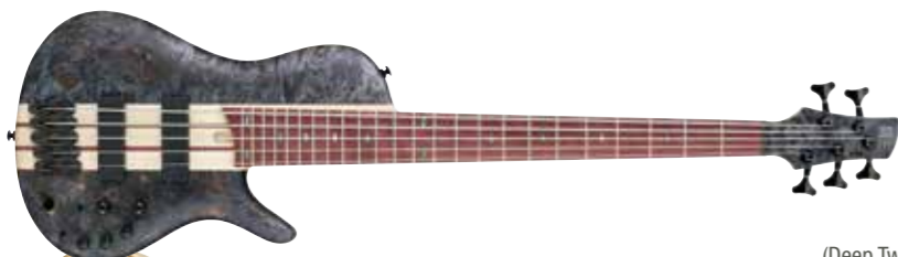
DTF (Deep Twilight Flat)