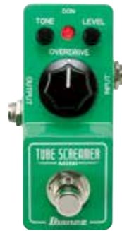
TUBE SCREAMER mini