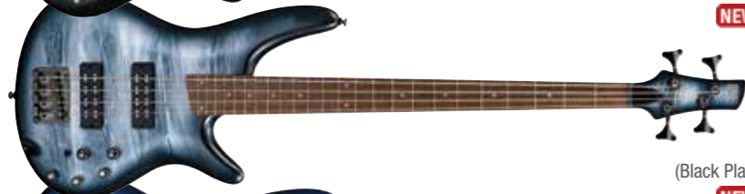
BPM (Black Planet Matte) NEW FINISH