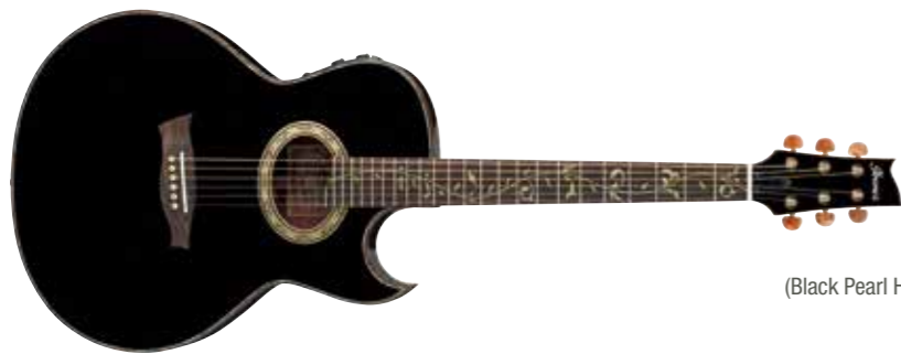
BP (Black Pearl High Gloss)