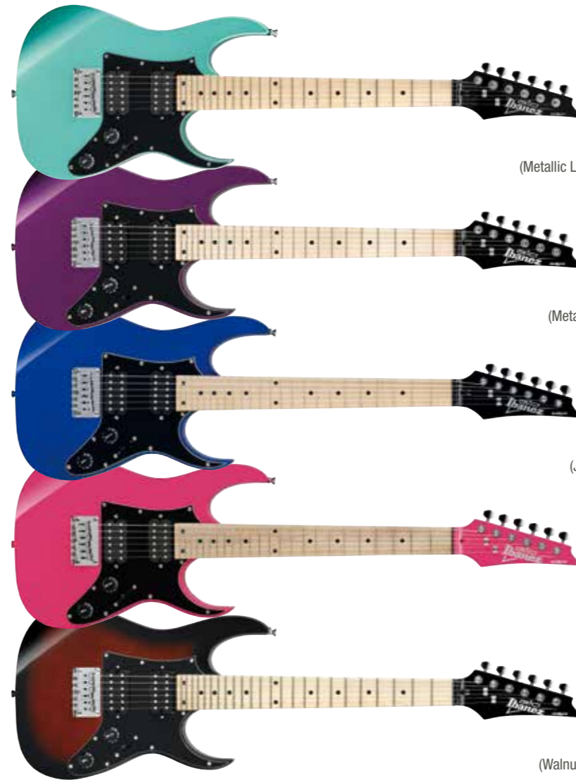
MGN (Metallic Light Green)