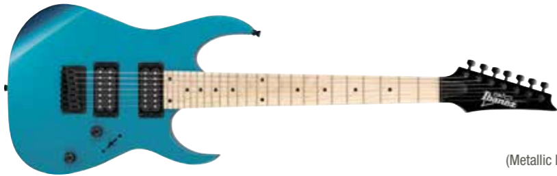
MLB (Metallic Light Blue)