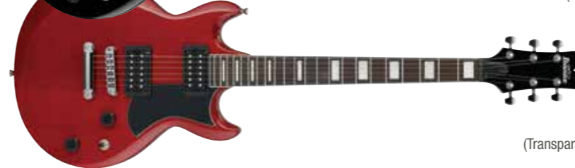
TCR (Transparent Cherry)