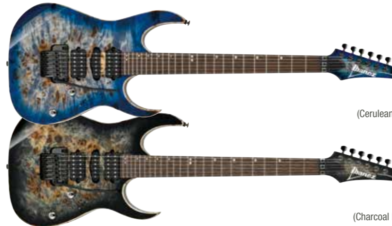
CBB (Cerulean Blue Burst)