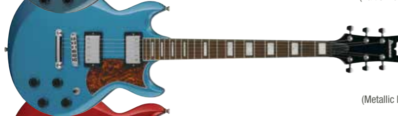
MLB (Metallic Light Blue)