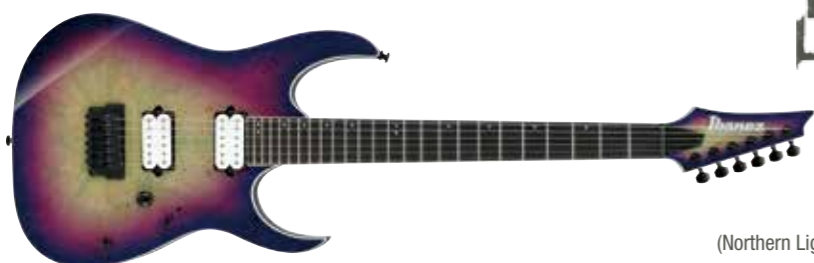
NLB (Northern Lights Burst)