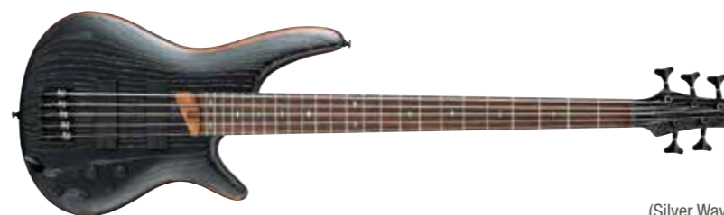
SKF (Silver Wave Black Flat)