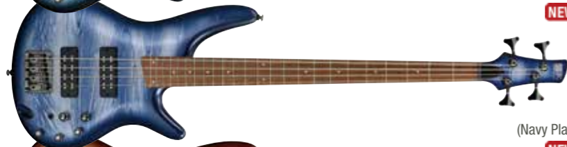
NPM (Navy Planet Matte) NEW FINISH