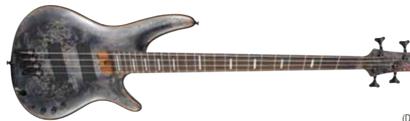
DTW (Deep Twilight)