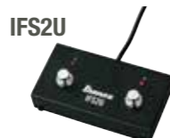
Sold Separately Dual Unlatching footswitch