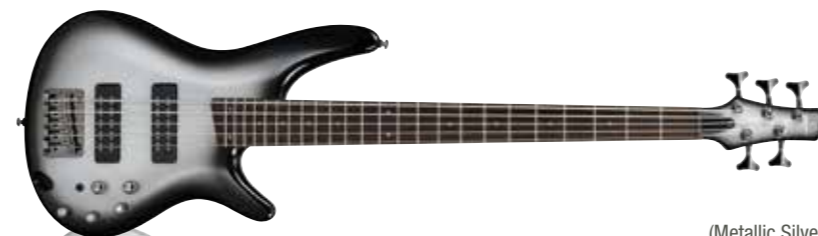
MSS (Metallic Silver Sunburst)