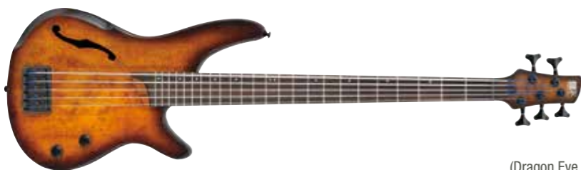
DEF (Dragon Eye Burst Flat)