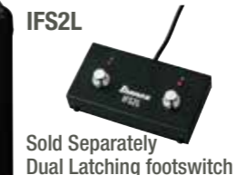
Sold Separately Dual Latching footswitch