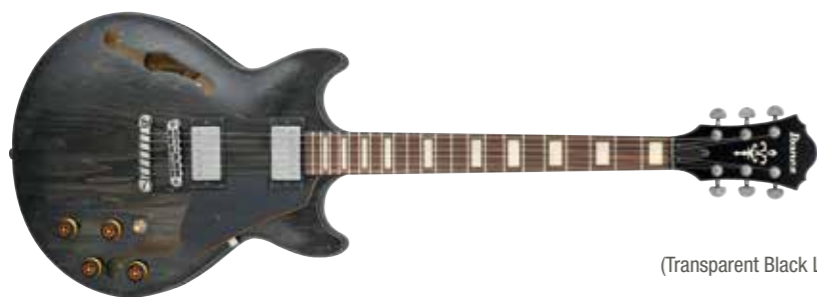
TKL (Transparent Black Low Gloss)