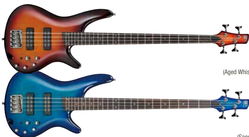
AWB (Aged Whiskey Burst)