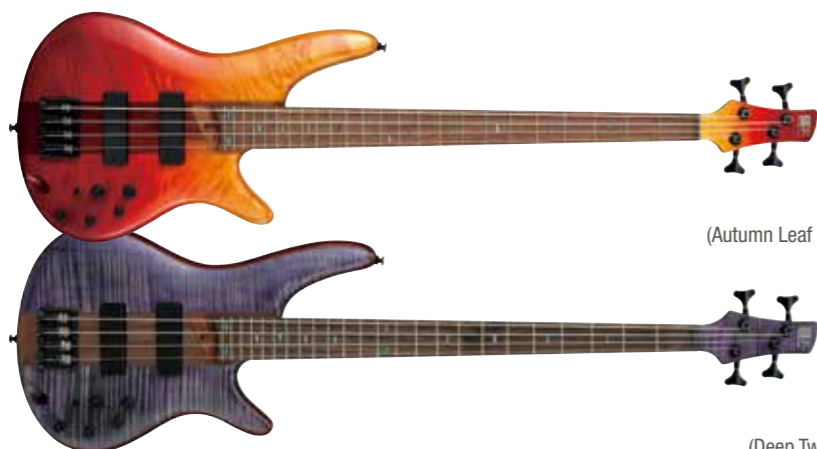
ALG (Autumn Leaf Gradation)