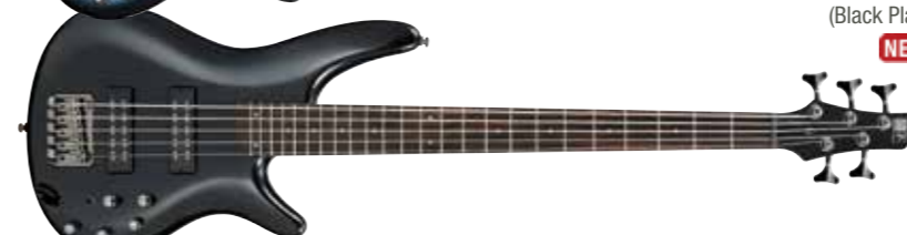
IPT (Iron Pewter) NEW FINISH