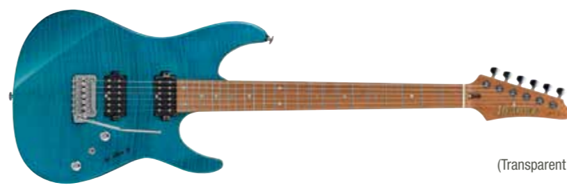
TAB (Transparent Aqua Blue)