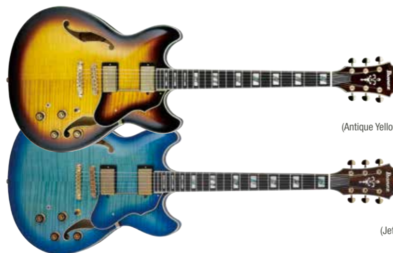
AYS (Antique Yellow Sunburst)