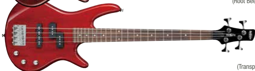
TR (Transparent Red)