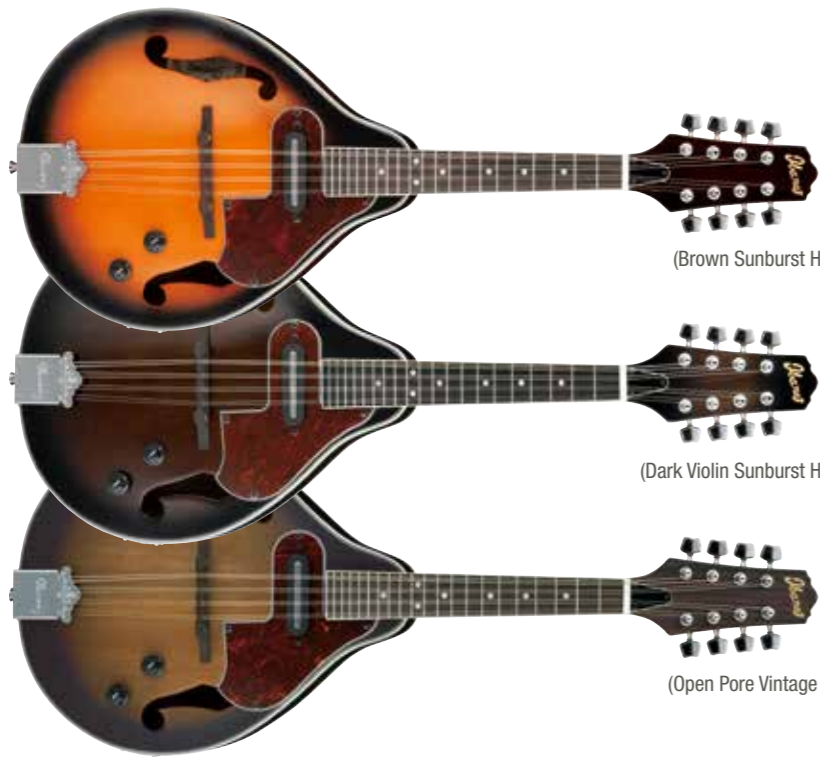
BS (Brown Sunburst High Gloss)