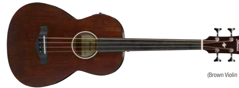
BV (Brown Violin Semi-Gloss)