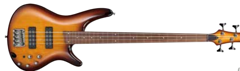
BBT (Brown Burst)