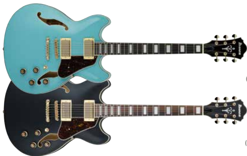
MTB (Mint Blue)