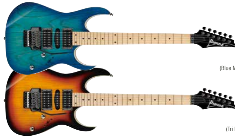
BMT (Blue Moon Burst)