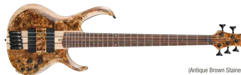
ABL (Antique Brown Stained Low Gloss)