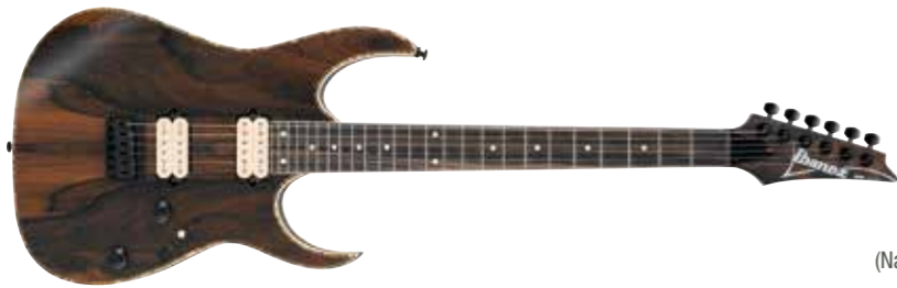
NTF (Natural Flat)