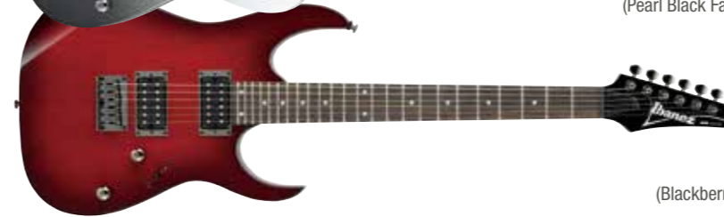
BBS (Blackberry Sunburst)