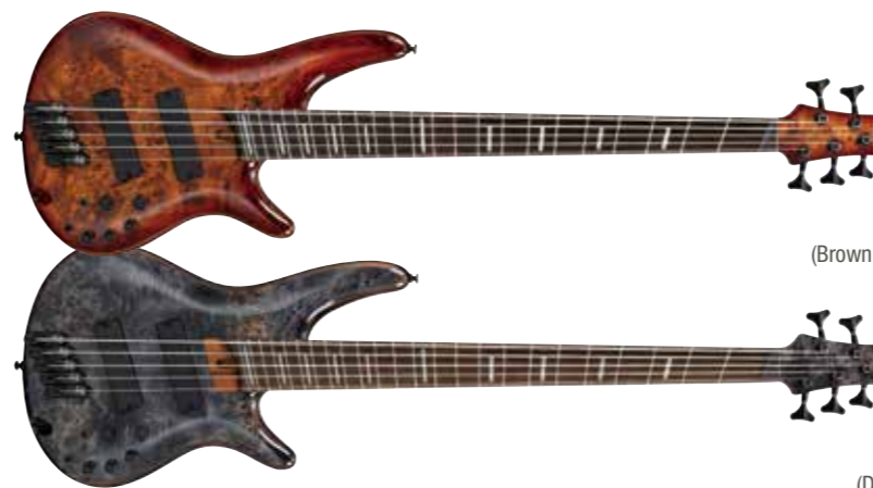
BTT (Brown Topaz Burst)