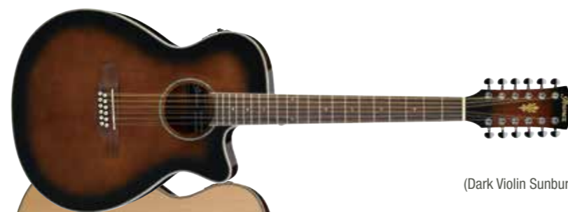
DVS (Dark Violin Sunburst High Gloss)