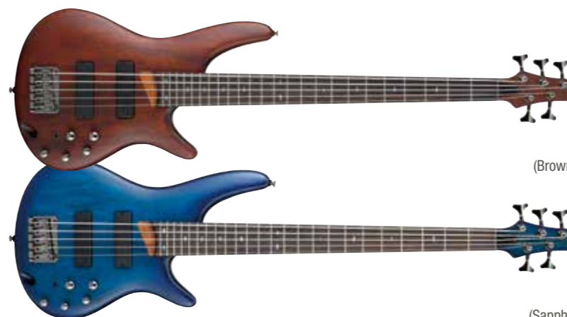
BM (Brown Mahogany)