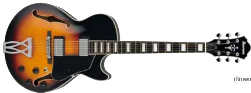
BS (Brown Sunburst)