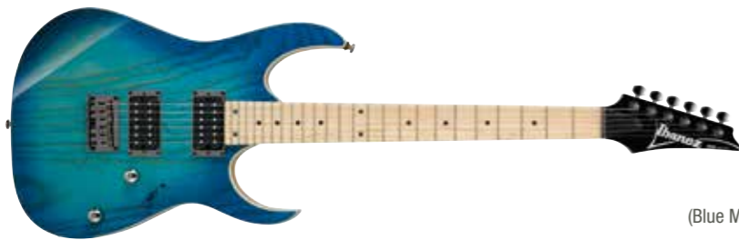
BMT (Blue Moon Burst)