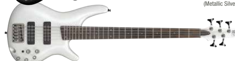
PW (Pearl White)