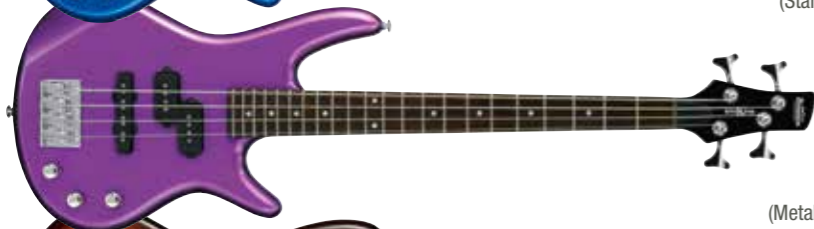
MPL (Metallic Purple)