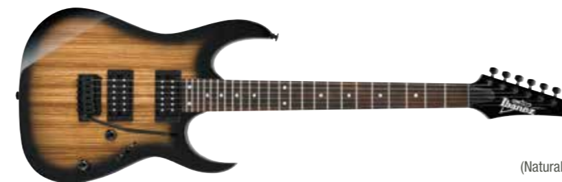
NGT (Natural Gray Burst)