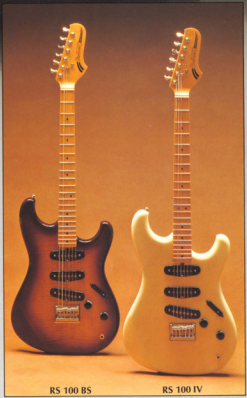
RS 100 BS

Body: Solid Ash Neck: One-piece rock maple Frets: 21 Velvo-Touch frets Scale: 25 1/2" Pickups: Super-Tap 6 Controls: Master volume, master tone 5-position pickup selector 2-position tap switch Accu-Cast Velvo-Tune Mini-II Hardware: New Nicheone plating Finishes: Natural (NT), Traditional Violin (TV)