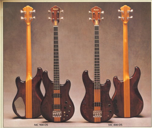
MC 900 DS