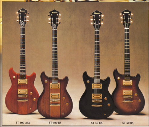
ST 100 AM