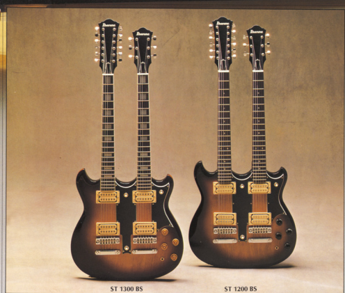
ST 1300 BS

Body: Mahogany Neck: Laminated Rock Maple Fingertboard: Rosewood with 24 frets Scale: 25 1/2" Pickups: V-2 Controls: Master volume, master tone Bridge: Gibraltar Tailpiece: Quik-Change Tuners: Velve-Tune II 18 to 1 ratio Hardware: None Ni-Chrome plated Finishes: Brown Sunburst (BS), Black (BK)