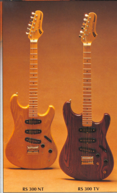
RS 300 NT

The Roadster Series also features many details that combine to make it the most advanced high-performance guitar of its type available anywhere. The slim maple neck is satin finished for smooth and effortless playing and is fitted with Ibanez Velvo-Touch frets to make the action even more buttery. A solid brass nut is hand-fitted to the fingerboard to improve sustain and brilliance. The list goes on, so check out a Roadster for the ride of your life.