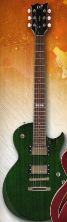
Bruce Kulick Union