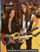
Michael Wilton & Chris DeGarmo/Queensrÿche