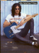
Gilly Clarke/Guns N' Roses