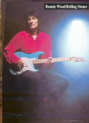
Eddie Wood/Rolling Stones