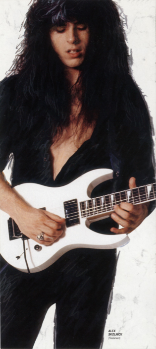
ALEX SKOLNICK (Testament)