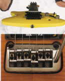
HQ Low Profile tremolo bridge

The 540S series has been considerably expanded since its introduction and is now available with four different pickup configurations, four different neck styles (including All-Access), both Edge and Low Profile tremolos, and either locking nut or locking tuners. The 540's mahogany body and ultra-fast Wizard neck have made it a favorite of players spanning every style of music from Fusion and Metal to Country and Blues.