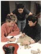
Designers use clay models to develop new ideas.