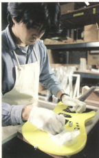
Careful hand assembly takes first rate instruments.