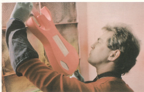
Custom finishes and new colors are checked on prototype guitars.